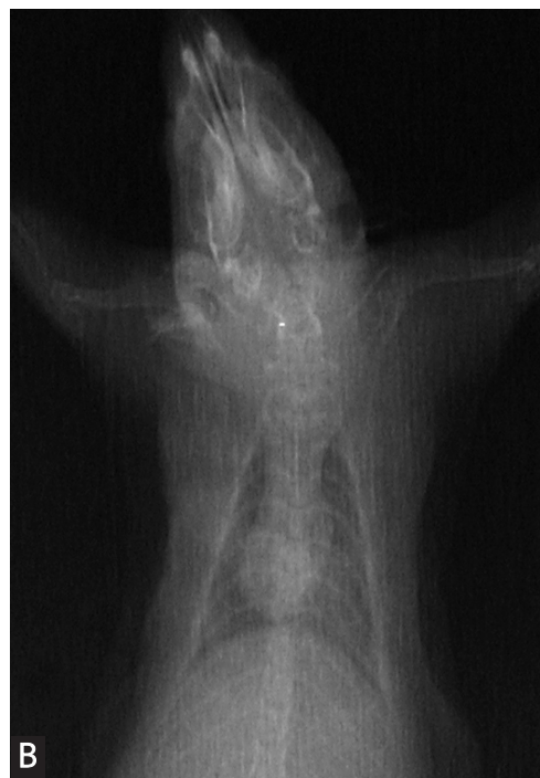
Figure 2. Pneumothorax (A) and reexpansion (B) were confirmed with control chest X-ray in all groups