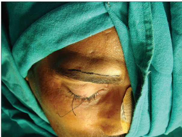
Figure 1: Upper eyebrow incision

Although several hypotheses have been put forward, the cause of TN has not been fully explained in the literature. For most patients, the cause is unknown as was in our case. The most common reported cause of TN is compression of the nerve root. Mechanical compression of the TN can occur as the nerve leaves the pons and traverses the subarchonoid space toward Meckel's cave. Most commonly, the nerve compressed by a major artery, usually the superior cerebellar artery. When pain is felt in second and third divisions, the usual