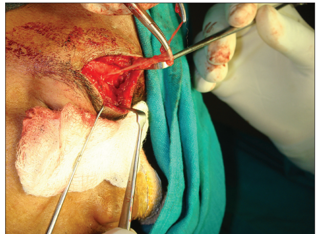
Figure 2: Supraorbital nerve held with artery forceps