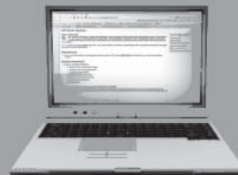
Table of contents Podcasts Ahead of Print Medscape CME Specialized topics