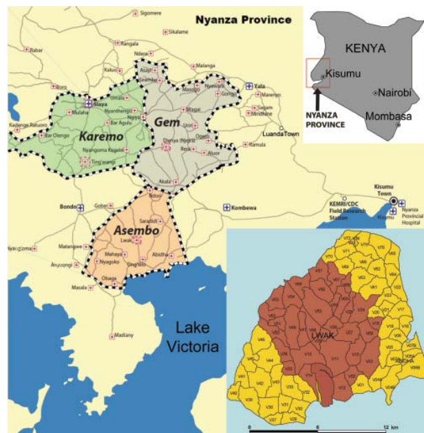
Figure 1. Locations of villages (brown shading in inset map) in Asembo area of western Kenya where the study was conducted, January 2007 through October 2008. Used with permission of Kenya Medical Research Institute/Centers for Disease Control and Prevention Research and Public Health Collaboration.

To detect rickettsial DNA, we performed 3 quantitative PCRs: a genus-specific assay selective for a 74-bp segment of the citrate synthase ( gltA ) gene, a group-specific assay that detects a 128-bp segment of the outer membrane protein ( ompB ) gene for tick-borne rickettsiae, and a species-specific assay that detects a 129-bp segment of the ompB