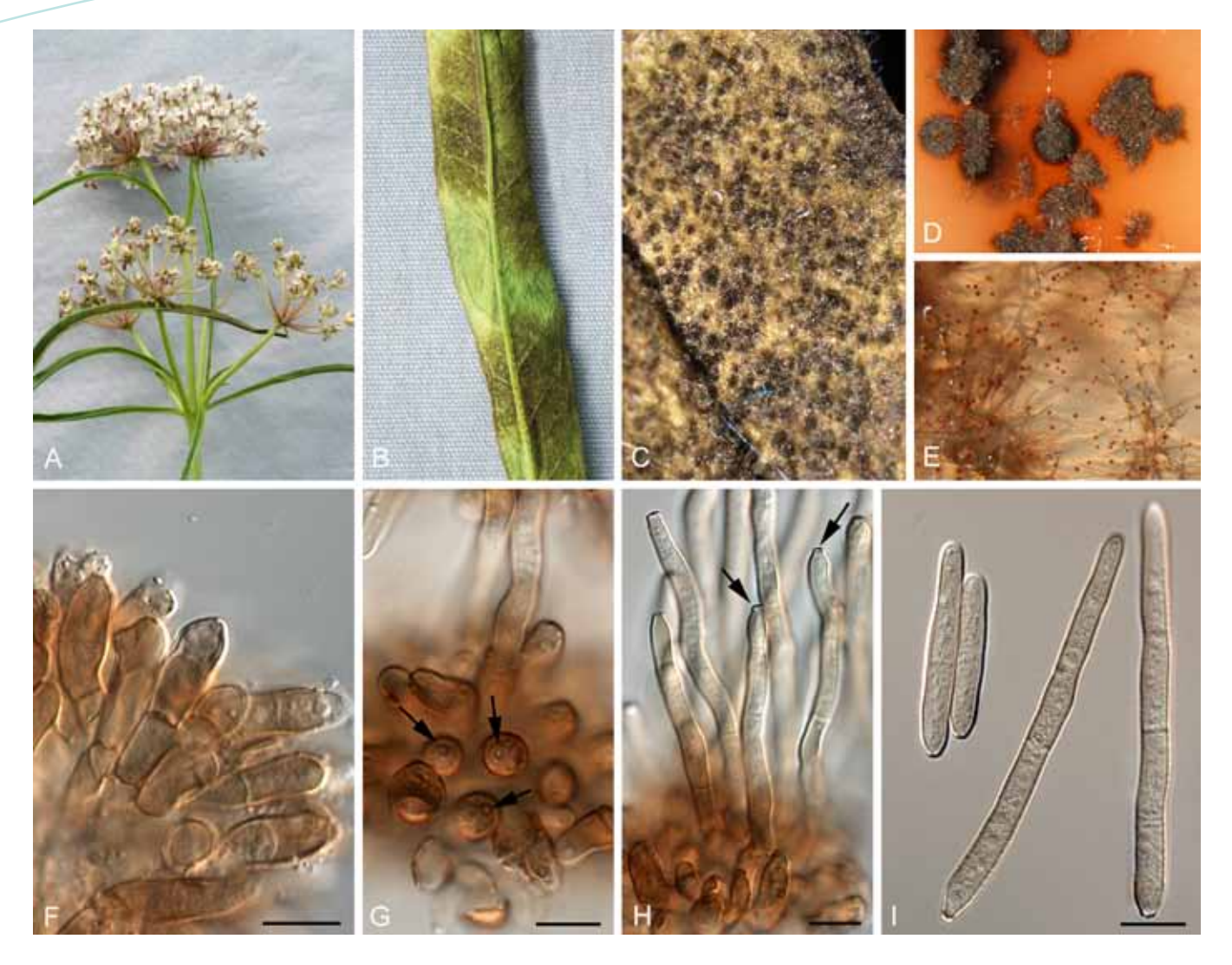
Fig. 2. Passalora californica (CBS H-20512). A, B. Leaves of Asclepias fascicularis infected with P. californica . C. Fructifications on leaf surface. D. Diffuse red pigment surrounding colonies on OA. E. Red crystals forming in PDA. F, G. Conidiophores with conidiogenous cells that can become cylindrical and elongated (arrows denote scars). I. Conidia with characteristic basal attenuation. Bars = 10 μm.

and MEA became up to 300 \mu m long, but retained the same conidial width and characteristic obconically truncate basal cell with prominent taper.