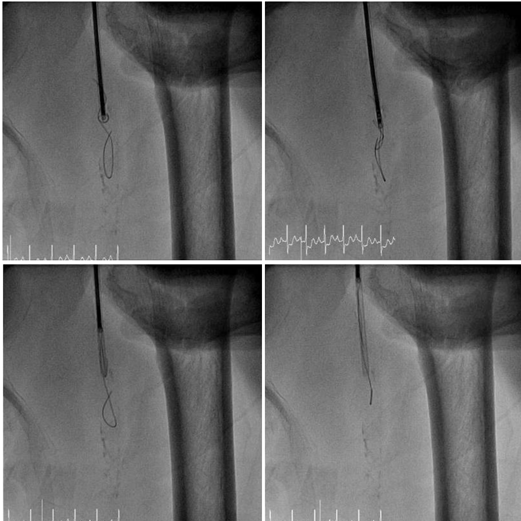
Fig. 2. Retrieval of the fractured guide wire using a biopsy forcep.

removal, 5) use of an embolic protection device, 4) stenting over the retained wire, 5) and conservative treatment. 6) We considered these methods for our case to successfully retrieve the fractured and remaining 035 Terumo wire in the femoral artery.