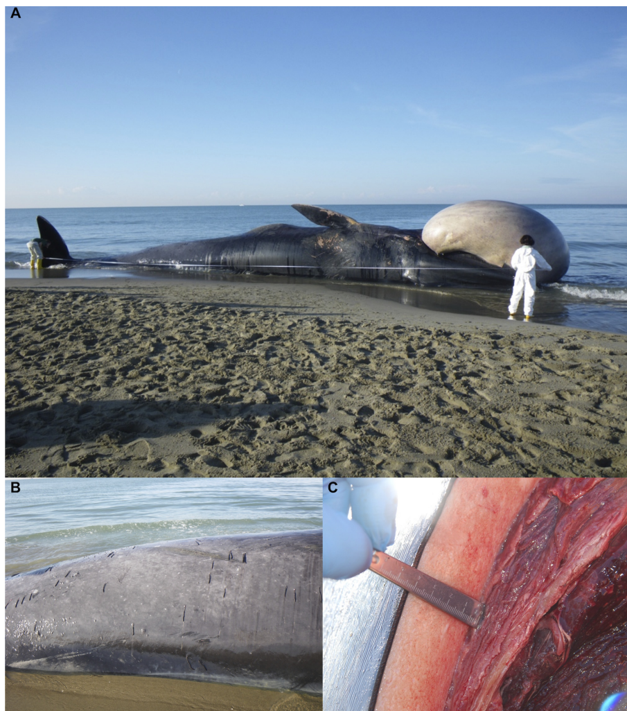
Figure 1 Steps of the necropsy carried out on the stranded whale. Biometrical measurements were taken before starting post-mortem analyses (A). A severe cutaneous parasitic infestation by Pennella spp. (B) was evident during external examination and a poor body condition was assessed due to a reduction of the blubber layer (C).

Masson's trichrome, Gram). Microbiological, immunohistochemical and biomolecular investigations for the main cetacean pathogens ( Morbillivirus , Herpesvirus , Brucella spp., and T. gondii ) were also performed on all major organs. Specifically, we utilized RT-PCR techniques targeting a highly conserved Morbillivirus nucleoprotein gene sequence (amplicon size 287 bp) and PCR techniques amplifying a conserved region of the nss-rRNA gene (approximately 300 bp in size) of coccidian parasites (Apicomplexa). Furthermore, immunohistochemical labeling for Morbillivirus and T. gondii antigens was attempted on molecularly positive tissues [7].