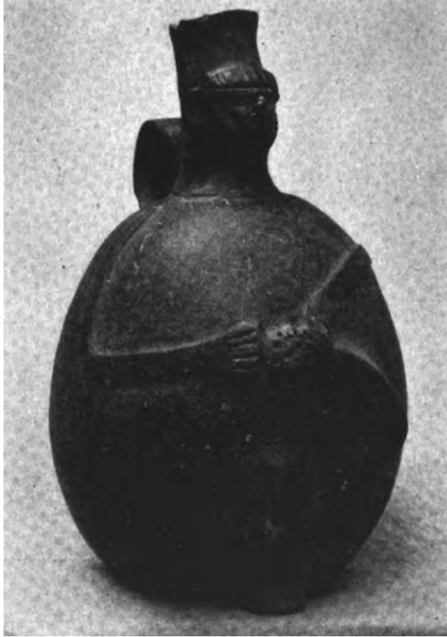
Figure 2. Chimu culture huaco depicting a person extracting parasites with an awl from the sole of the left foot. Multiple holes of various sizes can be seen on the huaco .