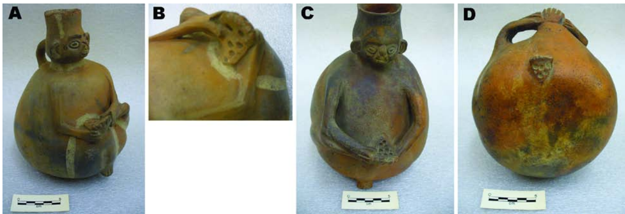
Figure 3. Two globular Chimu huacos found in Pachacamac, a sandy land area in northern Lima. Each person is examining the soles of the feet, on which multiple punch-out lesions can be detected. Panels B and D are close-up views of the feet of the huacos shown in panels A and C, respectively. Catalogs B/8853 and B/8854, courtesy of the Department of Anthropology, American Museum of Natural History.