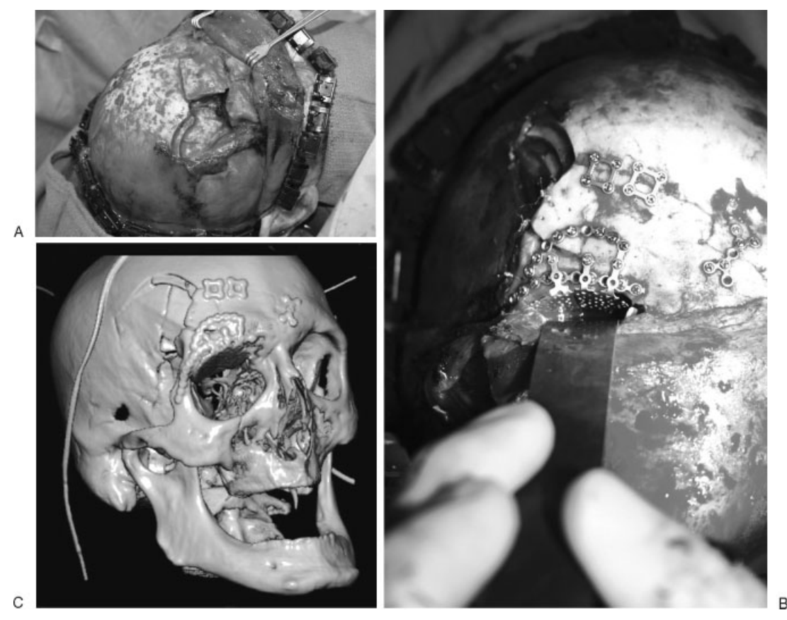
Figure 6 (A–C) Surgical management of the orbital roof fracture from Fig. 5 required management of the frontal sinus fracture, reconstruction of the orbital roof, and fixation of the lateral orbital wall at the zygomaticofrontal suture.

with this approach are considerable. With more extensive fracture patterns, such as with accompanying nasoorbitoethmoid fractures and orbital roof fractures, access may be achieved via a bicoronal and/or lowereyelid/intraoral approach.