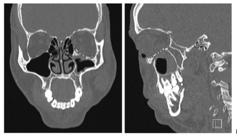
Figure 7 (A, B) Surgical management of the orbital floor fracture from Fig. 3 required a lower-eyelid incision and orbital floor reconstruction. Care should be taken not to place implants too far posteriorly, as this may impinge on the optic nerve; however, it is important to make sure that the posterior portion of the implant does not rest within the maxillary sinus, increasing the risk of postoperative enophthalmos.

enophthalmos related to fat atrophy, orbital volume can be re-established with onlay alloplastic or autogenous bone grafts. In general, fat atrophy creates both enophthalmos and hypoglobus, and a posterior orbital implant with anterior extension below the globe may be used. If the problem is mostly direct enophthalmos, then an implant positioned in a posterolateral location within the orbit is required.