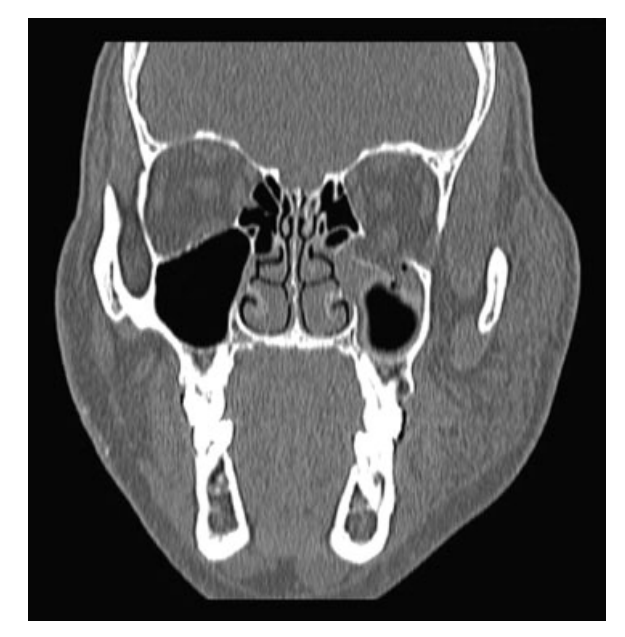
Figure 2 Orbital floor fracture that involves greater than 50% of the orbital floor with enophthalmos greater than 2 mm. These cases may not present clinically with enophthalmos in the acute setting because of significant soft tissue edema, which is why CT scans play a major role in diagnosing operative candidates in the acute stages.

In children, determination of restricted gaze excursion may be difficult, as children are frightened to report diplopia, and may poorly cooperate due to pain associated with muscle entrapment and subsequently keep their eye closed. A higher degree of suspicion should be had in the pediatric population when the child presents with an orbital fracture, nausea and vomiting, as this clinical triad carries a greater than 80% positive predictive value for entrapment, which necessitates a more urgent intervention.<sup>13</sup> Diagnosis of inferior rectus entrapment within the orbital floor fracture may be confirmed by CT scan. However, it should be noted that CT imaging does not always correlate well with the clinical findings. Some "entrapments" on CT scan may present without clinical dysmotility, and some muscle sheath or frank muscle belly entrapments can be missed by radiologists. Figure 2 shows an inferior rectus muscle in the plane of the usual position of the orbital floor. The wide space around the muscle suggests no entrapment at this section of imaging, but with tremendous local inflammation and swelling, the muscle might behave as though it is entrapped (Fig. 2). Figure 3 demonstrates tissue incarceration by a fracture of the orbital floor. The otherwise normal shape and size of the inferior rectus muscle belies muscle injury or entrapment, but the clinical examination may tell a different story (Fig. 3).