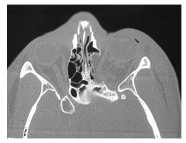
Figure 4 Medial wall fractures of the orbit have the potential risk of medial rectus entrapment and enophthalmos. The risk of enophthalmos, though, is not necessarily the same as with similarly sized orbital floor fractures. This is because the force of gravity is not displacing orbital contents into the areas of the adjacent sinus, as with orbital floor fractures.

The lateral orbital wall functions to contain the lateral orbital contents and provides the upper-third of the face with its width. Additionally, the lateral wall is the site of