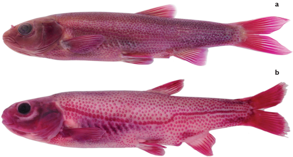
Figure 3. a Telestes dabar , alizarin stained specimen, PZC 575, 63.7 mm SL, Bosnia & Herzegovina: Vrijeka River, Dabarsko Polje b Telestes metohiensis , alizarin stained specimen, 63.3 mm SL, PZC 312, Bosnia & Herzegovina: spring Ljeskovik in Zalomka River, Nevesinjsko Polje.

gate. Caudal-peduncle depth only slightly less than half maximum body depth; head length greater than maximum body depth. Eye small, its diameter smaller than snout length. Snout fleshy, slightly to markedly projecting beyond upper lip (similar to a feature Kottelat and Freyhof [2007: fig. 39] called the “rostral cap,” which covers all or part of upper lip); snout terminating laterally in prominent crease along anterior edge of first infraorbital. Mouth subterminal, tip of mouth cleft at level of ventral margin of eye or, more frequently, below it. Lower jaw-quadrant junction at vertical through anterior half of eye. Length of lower jaw 10–12% SL or 36–41% HL, or 102–132% depth of operculum.