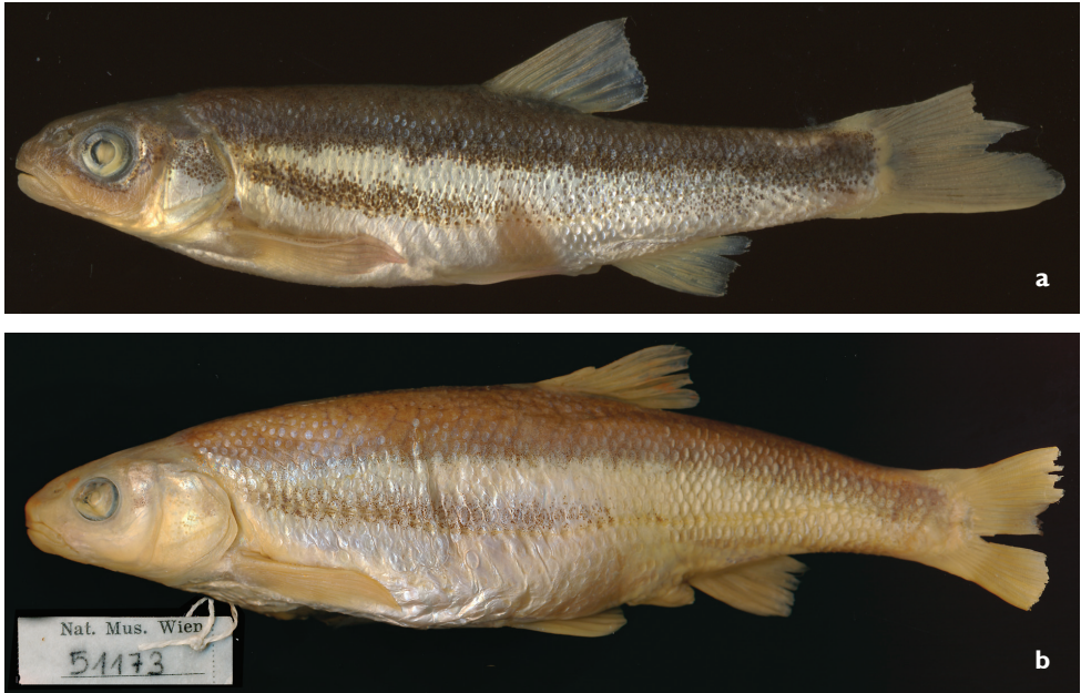
Figure 7. Telestes miloradi , Croatia: Ljuta River at Gruda, Konavosko Polje a Holotype, male, 66.7 mm SL, NMW 95296 b paratype, female, 119.3 mm SL, NMW 51173.