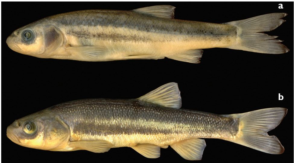
Figure 1. a Telestes dabar , holotype, female, 79.1 mm SL, NMW 95295, Bosnia & Herzegovina: Opačica River, Dabarsko Polje b Telestes metohiensis , female, 82.1 mm SL, PZC 293, Bosnia & Herzegovina: Zavidolka River (Zalomka River system), Nevesinjsko Polje.

Diagnosis. Telestes dabar is distinguished from T. metohiensis and T. miloradi by having the following combination of characters: slightly curved dark stripe (obvious in live and preserved specimens) present from just behind operculum to vertical just anterior to origin of anal fin, this stripe narrow and separated from dark pigmented area on back along its entire length; scales on most of body not overlapping but situated close to one another; scales overlapping behind pectoral girdle along lateral line and usually