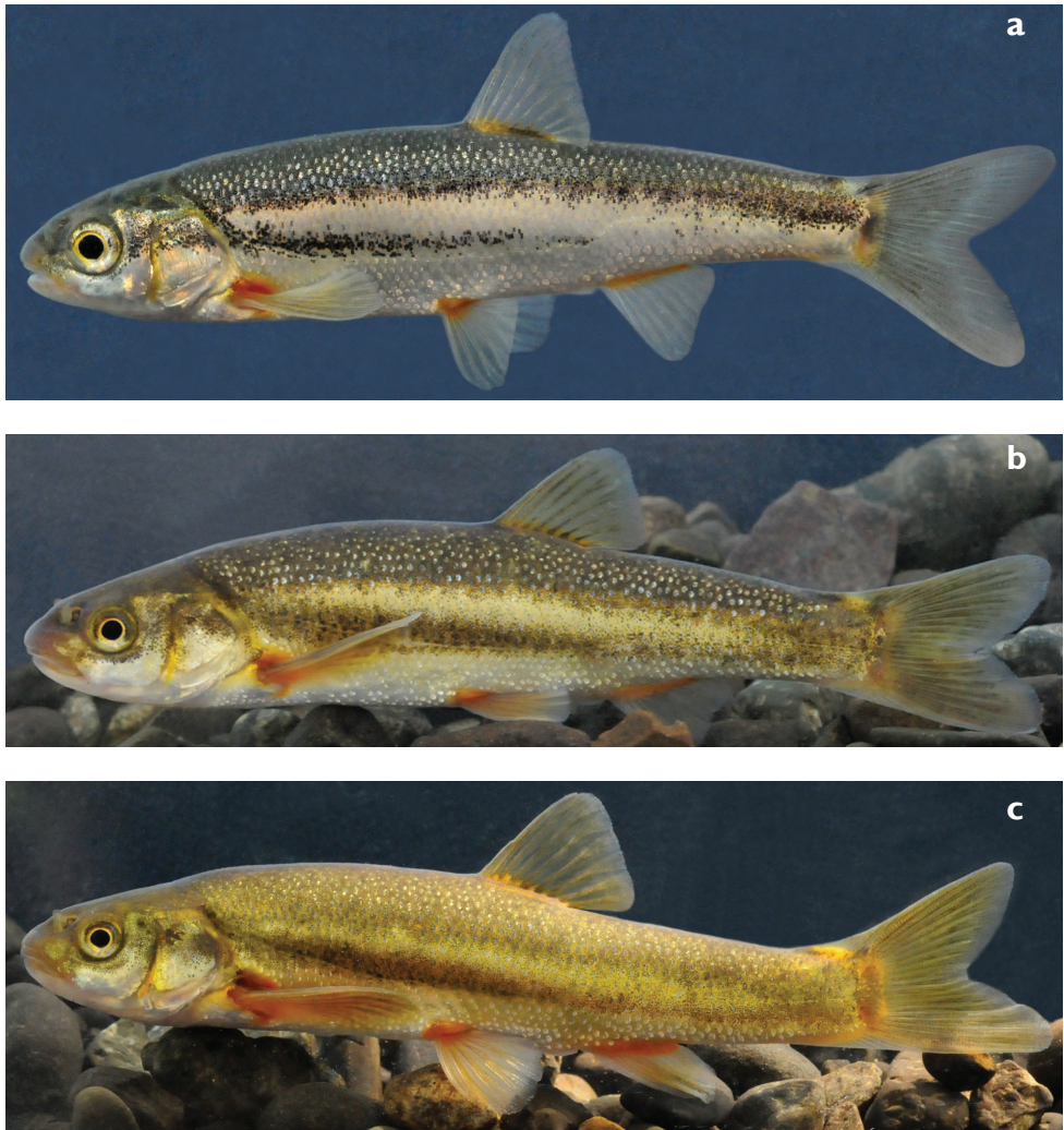
Figure 2. a Telestes dabar , male paratype, live specimen, ZISP 54995, 58.9 mm SL, Bosnia & Herzegovina: Opačica River, Dabarsko Polje b Telestes metohiensis , live specimen, male, 86.2 mm SL, PZC 567, Bosnia & Herzegovina: spring Ljeskovik in Zalomka River, Nevesinjsko Polje c Telestes metohiensis , live specimen, male, 84.5 mm SL, PZC 566, Bosnia & Herzegovina: Zovidolka River (Zalomka River system), Nevesinjsko Polje.

on caudal peduncle; snout with fleshy tip projecting over upper lip; mouth subterminal with tip of mouth cleft at or below level of ventral margin of eye; lateral line usually interrupted, with 24–69 total lateral-line scales; branched dorsal-fin rays usually 8\frac{1}{2} ; branched anal-fin rays usually 8\frac{1}{2} ; gill rakers 9 or 10; total vertebrae 39–41, mode 40; abdominal vertebrae 22–24, mode 22; caudal vertebrae 16–18, mode 17; head width 43–52% HL; and lower jaw long, length 10–12% SL.