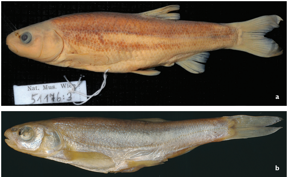
Figure 6. Telestes metohiensis . a NMW 51176:3, lectotype, 87.9 mm SL, ‘Mušica’ [Mušnica] River b NMW 51090 (labelled as affinis nomen museale), 57.9 mm SL, Zalomska [Zalomka River].

smaller than the lateral-line scales; and the scales are oval, somewhat deeper than long, on the flanks and elongated, longer than deep with a prominent posterior attenuation, on the caudal peduncle. In T. metohiensis the scales are more or less widely spaced and do not overlap on the entire body except for the lateral line; this feature can be seen in live specimens, Fig. 2b); the scales (Fig. 3b) above and below the lateral line usually are considerably smaller than the lateral-line scales; and the scales are almost circular on both the flanks and the caudal peduncle. Telestes dabar is further distinguished from T. metohiensis by having a black-and-white general colouration except for yellowish-orange pigmentation of the fin bases and yellow pigmentation in the iris and along the operculum in adults (vs. yellowish-green or greenish-bronze pigmentation of the whole body and fins in both young and adults, Fig. 2b–c). With regard to the morphometric features, T. dabar is rather similar to T. metohiensis , differing only in having a narrower head, maximum head width 12–15% SL or 43–52% HL and maximum cranial width 60–73% cranium roof length (vs. 13–17% SL or 51–59% HL, and 64–80% cranium roof length) (Table 1; differences are statistically significant at P < 0.0001 ).