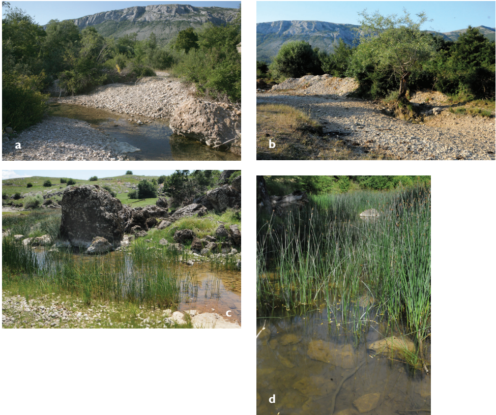
Figure 5. a Habitat of Telestes dabar : Opačica River at Potkom, Dabarsko Polje (type locality) b Opačica River 100 m away from the spring (8 July 2011) c–d habitat of Telestes metohiensis : Nevesinjsko Polje; c – spring Ljeskovik in Zalomka River (8 July 2011) d Zovidolka River at Udbine (8 July 2011). All in Bosnia and Herzegovina.

In samples collected in May, ripe males with small but prominent conical breeding tubercles. Tubercles regularly covering entire body, including dorsal and ventral surfaces of caudal peduncle, except for ventralmost surface of head. Single tubercle located on each scale. On all fins (except for caudal fin), tubercles present on both sides along all rays and on fin membrane, being particularly dense along marginal rays. Tubercles forming rows along outer margins of operculum and pectoral fin; tubercles in those rows larger than others on body. Degree of tubercle development varying between males with regard to both size of tubercles and their location. Tubercles always present on head, back, and pectoral fin. Males retaining tubercles, though reduced in size and density, until September.