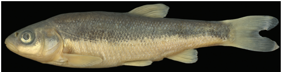
Figure 8. Telestes karsticus , PZC 504, 62.6 mm SL, Croatia: Sušik River, Danube drainage.