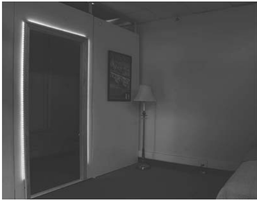
Figure 1. Novel nighlighting system concept. Low ambient illumination plus robust veridical spatial cues provided by self-luminous horizontal and vertical lines (H/V condition). Light for the H/V condition was produced by three linear arrays of amber light emitting diodes (LEDs) (LINEARFLEXSIDE; \lambda_{\max} = 615 nm, OSRAM SYLVANIA). The arrays were positioned behind the top and side edges of the plumb simulated door, mimicking how this novel lighting system might be installed in a residential bedroom. The top array was comprised of 68 LEDs and the two side arrays were each comprised of 140 LEDs. During an STS test subjects could not view the LEDs directly, thus eliminating glare from the bright point sources. Owing to the low light level at the cornea used in the present study, it was not possible to obtain a picture in the actual laboratory setting. This figure was taken from a previous experiment where a similar arrangement was applied.

doorframe contrasts and trial numbers) in a counterbalanced manner. Subjects performed three STS trials under every combination of lighting conditions and doorframe contrast in one session. Subjects adapted to each lighting condition for 20 min before the first trial under the prescribed lighting condition. Both simulated door contrasts were presented to subjects before a change in