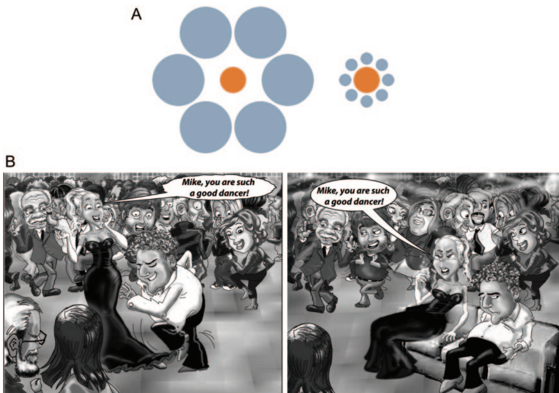
(A) The Ebbinghaus illusion. (B) The role of social context in semantic and situational meaning. Two different social contexts (in this case, indexed by the emotional expression, the dancing situation, and the other's actions) dramatically alter the meaning of the same sentence: "Mike, you are such a good dancer!" This figure makes a comparison between visual perception and social cognition by pointing out that they can both generate instances where the same stimulus is differentially experienced as a function of context. But there is also a difference. The perceptual illusion is obligatory (i.e., intrinsic to the hard-wiring of the visual system) whereas the utterance and interpretation of the comments in B are conditional. The femme fatale has the choice not to utter the comment and the young man has the option of interpreting the comment as wistful/friendly or sarcastic/cruel. The critical input of our brain (mainly prefrontal cortex) is probably based on its ability to coordinate conditional behaviors and interpretations in social situations. Illustration by Carlos Becerra (B).

the specific significance of an object. This is illustrated by figure 1B. Like the size of the circles in the Ebbinghaus illusion, the meaning of the sentence "Mike, you are such a good dancer!" is dependent on the contextual information.