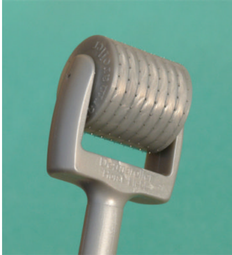
FIGURE 5: Dermaroller C8: home device.

was applied. This treatment was repeated twice with a one-month interval.