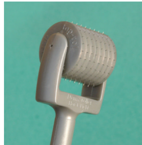
FIGURE 4: Dermaroller CIT 8: professional device.

were summated to obtain the total MASI score: forehead 0.3 (D+H)A + right malar 0.3 (D+H)A + left malar 0.3 (D+H)A + Chin 0.1 (D+H)A.