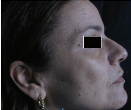
FIGURE 1: Digital standard photograph of a 44-year-old patient affected with melasma.