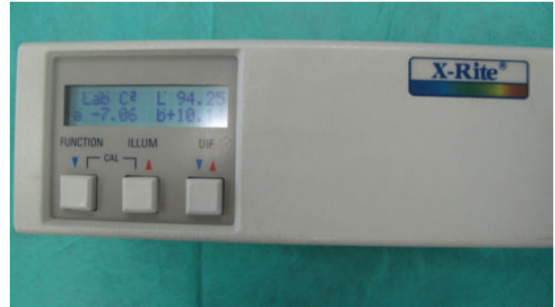
FIGURE 3: Spectrocolorimeter X-rite 968.