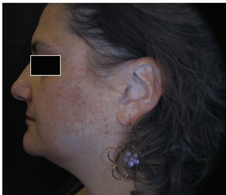
FIGURE 8: UV digital photograph of 42-year old woman at baseline.

These results were confirmed by a statistically significant increase in the average luminance value (L*) in patients treated with skin needling and depigmenting serum (64.97) versus patients treated with depigmenting serum alone (61.61; paired Student's t -test; P < .05 ). Comparing luminance values (L*) before and after treatment, improvement translates into an increase in brightness of 17.4% in patients treated with skin needling and depigmenting serum; patients treated with depigmenting serum alone showed an increase in brightness of 11.2%, but it was less evident than the increase in brightness of the side treated with skin needling + depigmenting serum.