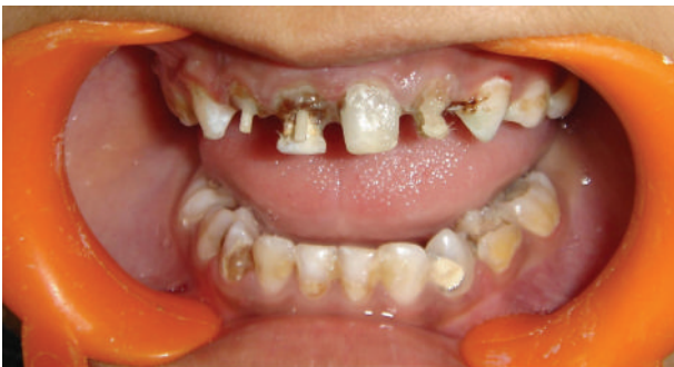
FIGURE 5: Glass fibre-reinforced composite post (GFRC) inserted.

the etched surface and uniformly dispersed by a compressed air blast. It was then light cured with for 20 seconds. The GFRC post was then cured for 20 seconds in order to gain rigidity, before insertion into the post space. Light cured flowable composite resin was then inserted into the canal chamber after which the GFRC post was inserted (Figure 5). The fiber post and composite were then cured with together for 60 seconds. The coronal portion of the glass fibre-reinforced composite post was splayed to increase the surface area for the retention of the core.