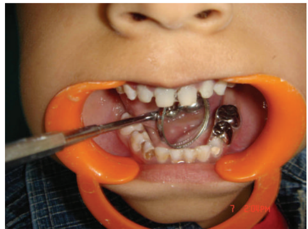
FIGURE 3: 74 and 75 were grossly carious and were indicated for pulpectomy followed by a stainless steel crown.

Unsupported enamel was not removed so as to preserve as possible. The pulp chamber was opened and working length determination IOPA was taken with a no. 10 K-file. The pulp tissue was extirpated using no. 10–no. 35 K-files. After irrigation with copious amounts of 2.5% NaOCl and normal saline, the root canal was dried using paper points. A thick mix of Endofloss paste was then condensed with lentulo spiral into the canal. The obturated material was allowed to set for 10 minutes (Figure 4).