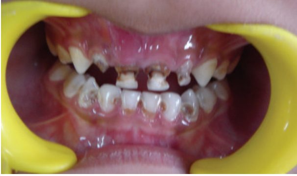
FIGURE 1: Preoperative intraoral photograph of the patient.

to construct an intracanal post include resin composite crown reinforcement, translucency, and relative ease of manipulation [5, 6].