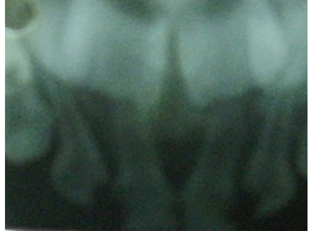
FIGURE 2: Intraoral periapical radiographs revealed pulp involvement of 52, 51, 61, and 62.

2.1. Step 1: The Endodontic Phase. An infraorbital block was administered for 61 and 62, and labial and palatal infiltration was carried out for 51 and 52. Gross carious lesions were removed with a no. 330 round carbide steel bur.