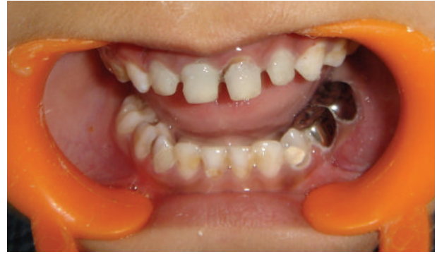
FIGURE 6: Postoperative intraoral photograph of the patient.

Esthetic restoration of primary teeth has long been a special challenge to pediatric dentists. When there is severe loss of coronal tooth structure, the use of posts placed inside