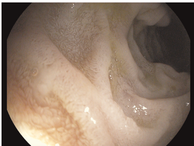
FIGURE 1. Endoscopic appearance of environmental enteropathy. Endoscopic view of second part of the duodenum showing villi with characteristic changes of environmental enteropathy: fusion of villi so that instead of a finger-like appearance they take on a leaf-shaped appearance. Sometimes villous fusion goes further and takes on a cerebriform (sulcus and gyrus) appearance.

location per se, that seem critical. 4 TE is certainly seasonal, and its severity appears to be predicted by intestinal carriage of organisms with pathogenic potential, such as Citrobacter rodentium and hookworm. 9 It is not found in newborns and fetuses in these settings, 10 suggesting that unhygienic conditions during early childhood initiate a chronic intestinal pathology that only resolves once living standards are improved. 11,12 Tropical enteropathy has therefore rightly been renamed “environmental enteropathy” (EE), although the precise etiology remains elusive. It is likely that repeated, often sub-clinical episodes of gastrointestinal infection with low doses of organisms possessing certain virulence factors, together with altered composition of the intestinal microbiota, lead to chronic enteric T cell-mediated inflammation. 13 Counter-intuitively, EE is associated with reduced expression of intestinal antimicrobial peptides. 14