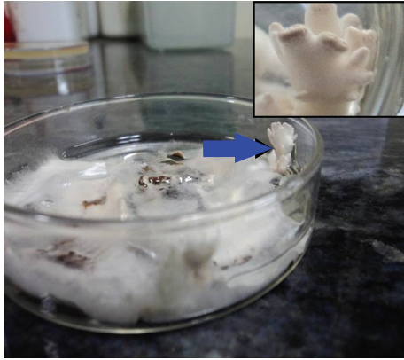
FIGURE 3: Fan-shaped fruiting bodies in banana peel culture (basidiocarps).