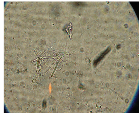
FIGURE 2: 10% KOH mount shows hyaline septate hyphae. (Magnification 40x).

disease, ulcerative lesions of the hard palate, and a nail infection. The isolation of S. commune from cerebrospinal fluid in a patient manifesting signs of atypical meningitis has been reported [10].