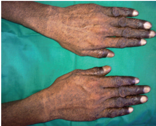
FIGURE 2: Photographs showing dark mottled pigmentation on the hands.

apparently normal appearing gingiva showed only a slight basal hyperpigmentation but virtually no melanophages in the connective tissue. Further, presence of melanin in the section was confirmed by bleaching using hydrogen peroxide and to rule out the possibility of hemosiderin pigment. Also, Masson-Fontana stained sections showed an increase in the number of melanocytes in the basal and suprabasal cell layers (Figure 4).