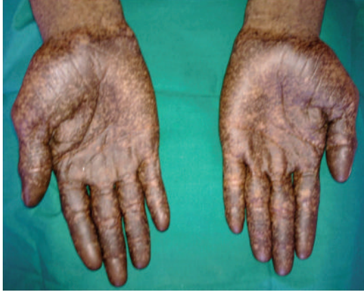
FIGURE 1: Photographs showing dark mottled pigmentation on the hands.