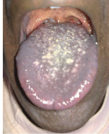
FIGURE 3: Generalised pigmentation seen on the dorsum of tongue with prominent lingual papillae.

Familial progressive hyperpigmentation is a distinctive, dominantly inherited genodermatosis, characterized by patches of hyperpigmentation present at birth, which increase in size and number with age [6]. Clinical features have been described variously as intense pigmentation either as jet black, dark brown, or bronze. Patchy hyperpigmentation occurring at birth or early infancy progresses relentlessly until it encompasses the entire body. Initial site of involvement is either the face or groin. Various patterns of