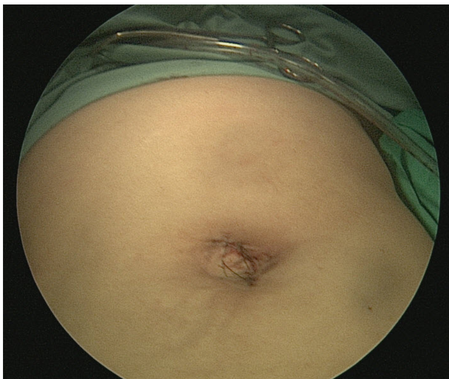
Figure 3 Single-port incision closed.

images. A copy of the written consent is available for review by the Editor-in-Chief of this journal.