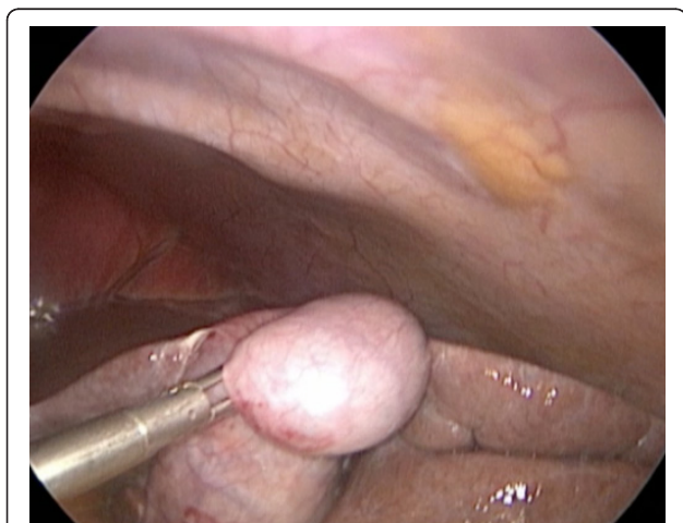
Figure 2 Gallbladder retraction.

Situs inversus totalis may affect the intra-abdominal viscera as well as the intrathoracic organs [2]. It can be associated with many other anatomical variations, including heart malformations and Kartagener's syndrome (bronchiectasis and sinusitis coexistence) [2,3]. There is no evidence to suggest that gallstones are more common in people with this condition. However, left upper quadrant pain may delay the diagnosis. An ultrasound scan can confirm the presence of gallstones and the left-sided gallbladder. Some authors suggest that it would be very useful to perform a magnetic resonance cholangio-pancreatography (MRCP) procedure in order to reveal the exact anatomy of the biliary tract [3], thus decreasing intra-operative complications and enabling better planning of the surgical procedure. Pre-operative knowledge of the presence of malrotation and its details is of prime importance, even more so when performing laparoscopic or minimally invasive surgery.