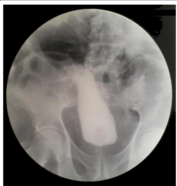
Figure 4 Post-operative contrast-enhanced retrograde cystography. The procedure was performed again to ensure the induction of the urinary bladder to its normal position.

surgeons [1,2]. They are uncommon in developed countries, and patients with such problems usually present with frequent UTI after years or even decades of neglect [3]. Generally, the UTIs are of a recurrent nature, and, apart from the classical complications of inguinal hernias, the specific problems cause dramatic impairment of the patient's quality of life [4]. The mobility of these patients is accordingly restricted, and they often have recurrent episodes of UTI for which they should receive appropriate antibiotic treatment [5,6]. Giant inguinoscrotal hernias are also often associated with extreme visceroptosis and tissue expansion of vascular pedicles