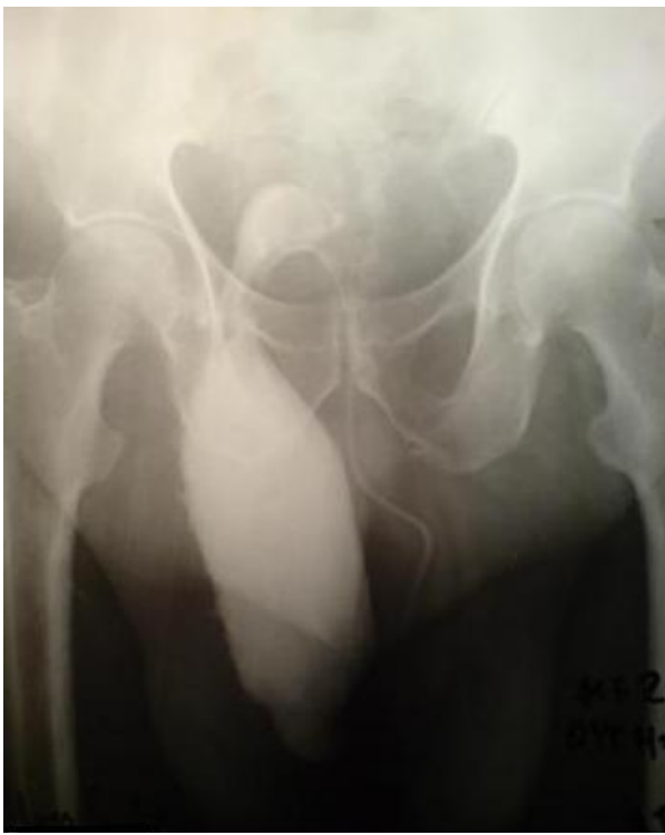
Figure 1 Pre-operative contrast-enhanced retrograde cystography. The incarcerated urinary bladder into the scrotum is shown.

(Figure 4). The patient remained under close post-operative medical observation and antibiotic treatment for 10 more days without complications. He was discharged in optimal condition on the sixth post-operative day.