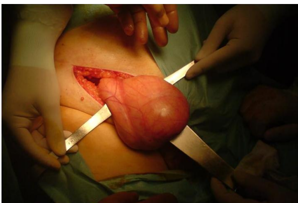
Figure 2 The urinary bladder after the adhesiolysis at the bottom of the hernia sac.

Inguinoscrotal hernias containing the urinary bladder are very rare, and their repair is a real challenge for