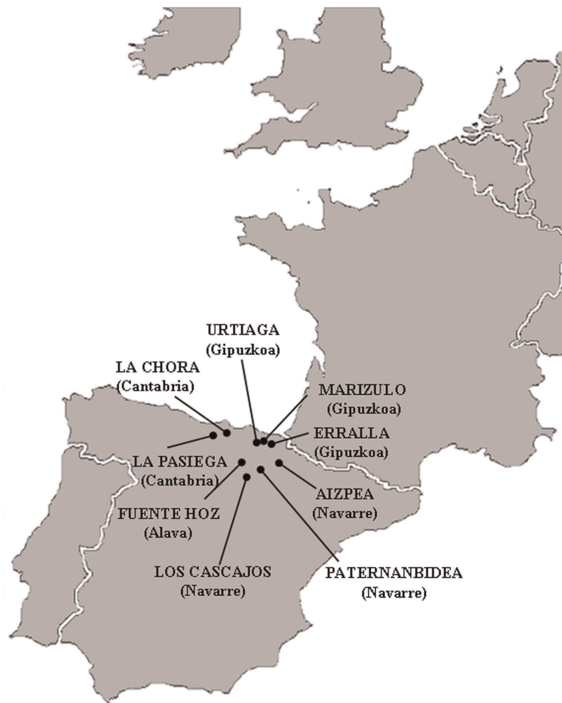
Figure 1. Geographic location of the ancient human remains analysed in the present study. All sites are located in the North of the Iberian Peninsula.