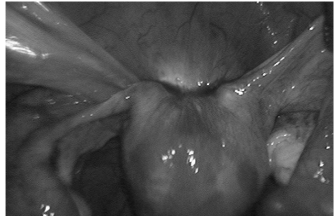
Figure 3. Bladder endometriotic (adenomyotic) nodule managed by full-thickness excision.

Delayed postoperative outcomes were favorable with a significant improvement in painful symptoms and the ab-