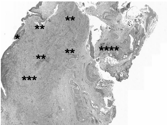
Figure 2. Histological findings in intrinsic ureteral endometriosis: *urothelium; **intrinsic endometriosis foci; ***ureteral muscular layer; ****ureteral adventitial sheath.

woman undergoing full-thickness excision of the dome nodule presented with a fistula between the bladder and anterior vaginal wall, requiring reintervention 5 weeks later, with a favorable outcome. Another woman with DIE of the bowel and an endometriotic nodule arising on the bladder trigon underwent full-thickness removal of the bladder nodule, total hysterectomy, and segmental resection of the sigmoid colon. Subsequent prolonged bladder atony required 4 to 5 bladder catheterizations per day over a 15-month period.