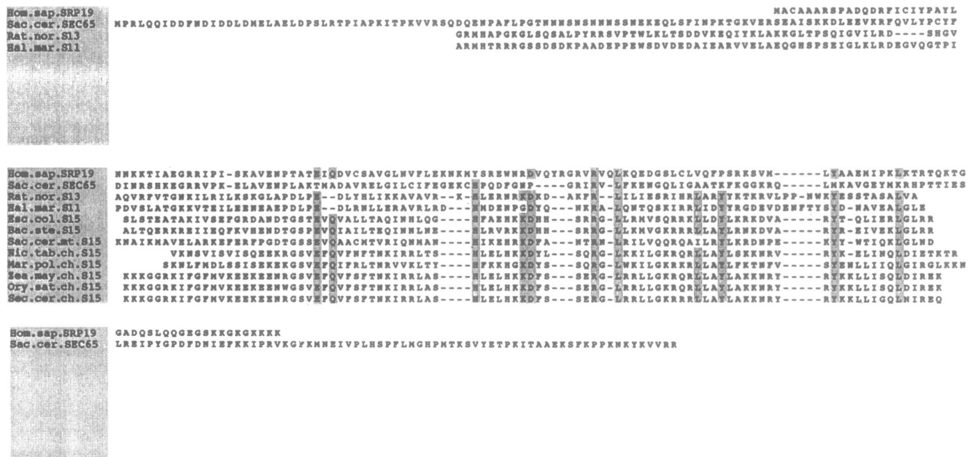
Figure 1. Alignment of tetraloop binding protein sequences related to SRP19 and ribosomal protein S15. Sequences of human protein SRP19 (Hom. sap. SRP19 (31)), the SRP19 homolog from Saccharomyces cerevisiae (Sac. cer. SEC65 (32)), rat ribosomal protein S13 (Rat. nor. S13 (33)), ribosomal protein S11 from Halobacterium marismortui (Hal. mar. S11 (34)), and the homologous ribosomal proteins of Escherichia coli (Esc. col. S15 (35,36,37)), Bacillus stearothermophilus (Bac. ste. S15 (34)), Saccharomyces cerevisiae mitochondria (Sac. cer. mt. S15 (38)), Nicotiana tabacum chloroplast (Nic. tab. ch. S15 (39)), Marchantia polymorpha chloroplast (Mar. pol. ch. S15 (40)), Zea mays chloroplast (Zea. may. ch. S15 (41)), Oryza sativa chloroplast (Ory. sat. ch. S15 (42)) and Secale cereale chloroplast (Sec. cer. ch. S15 (43)). Shaded areas indicate amino acids that are conserved in at least nine of the twelve sequences.