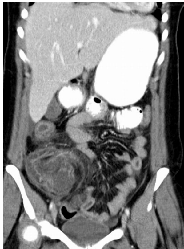
Fig. 1 Coronal CT scan image. A coronal CT scan image of a patient with neutropenic enterocolitis 10 days following chemotherapy for breast cancer. The cecum and ileum is grossly thickened with obliteration of the lumen.