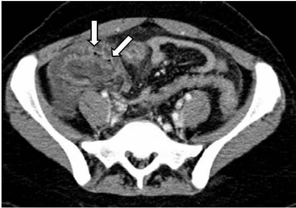
Fig. 2 CT scan cross section. Contrast enhanced CT scan of the same patient showing thickened cecal wall with air lucencies consistent with pneumatosis intestinalis (arrows).