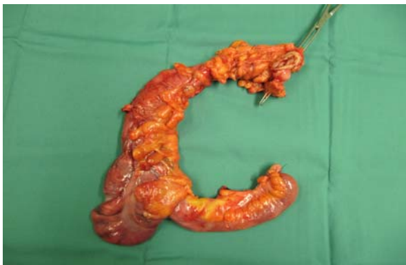
Fig. 3 Right hemicolectomy specimen. Resected specimen showing edematous, dilated ischemic cecum, ileum and ascending colon of a patient with neutropenic enterocolitis 10 days after chemotherapy for carcinoma of the breast.

Histopathological confirmation of the diagnosis is not feasible in most of the patients unless the patient has undergone surgical resection. Gross appearance of the resected pathological lesion reveals the bowel to be dilated, edematous and often hemorrhagic [1, 23, 25]. The cecal wall is thickened with diffuse loss of mucosa, hemorrhage and necrotic surface (Figs. 3 & 4). Varying amounts of mucosal & submucosal necrosis, hemorrhage and ulceration may be noted. Microscopic features include loss of mucosa, significant edema of submucosa with deep mural and transmural necrosis [16, 25].