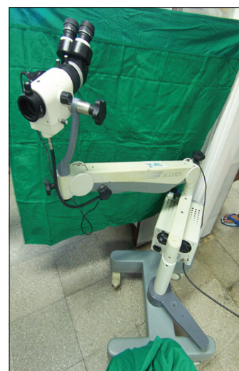
Figure 3: Colposcopy

and Drug Administration (USFDA) is frequently used. The sample is collected similar to Pap, with a cervical swab