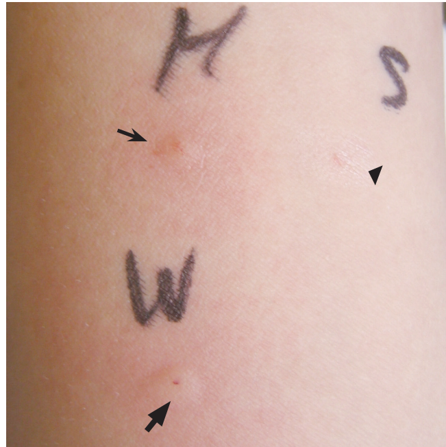
Fig. 1. Prick to prick test for walnuts. The positive control was histamine (4 × 4 mm, arrow), and negative control was normal saline (0 × 0 mm, arrow head). Prick to prick test for walnuts was positive (6 × 5 mm, bold arrow).

In oral challenge test for walnuts of 15 g, he tolerated except of oral itching, which showed that he had an oral allergy syndrome to walnuts. Exercise provocation test, free running for 10 min, was done on the other day and the result was negative. On another day, he took walnuts of 15 g and proceeded to free running for 10 min outside after 2 h. Only a few hives on neck and elbow were seen 2 h later. Although a diagnosis of food-dependent exercise-induced mild urticaria was established, anaphylactic events did not occur. We noticed that this food-exercise challenge was done in a cold environment (temperature of about -2°C), but prior events were induced in a warm environment (temperature of about 26°C). Oral food challenge test and exercise provocation test performed independently in a warm environment were negative. So he took 10 min exercise 2 h after walnut ingestion in a warm environment.