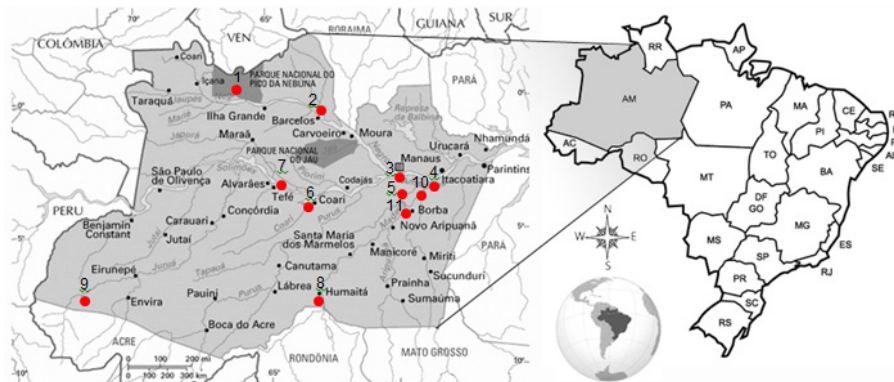
Figure 2 Map of the Amazonas State showing the municipalities where samples originated (1. São Gabriel da Cachoeira; 2. Barcelos; 3. Manaus; 4. Itacoatiara; 5. Careiro; 6. Coari; 7. Tefé; 8. Humaitá; 9. Guajará; 10. Autazes; 11. Borba).