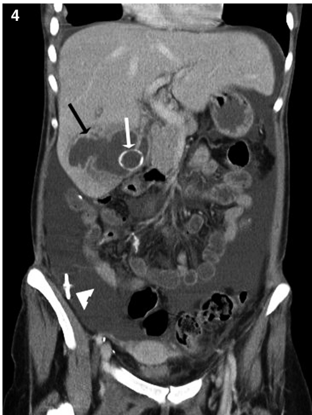
Fig. 1. Large solitary concrement of the gall bladder with a maximal diameter of 27mm, five years before onset of the gall bladder perforation.