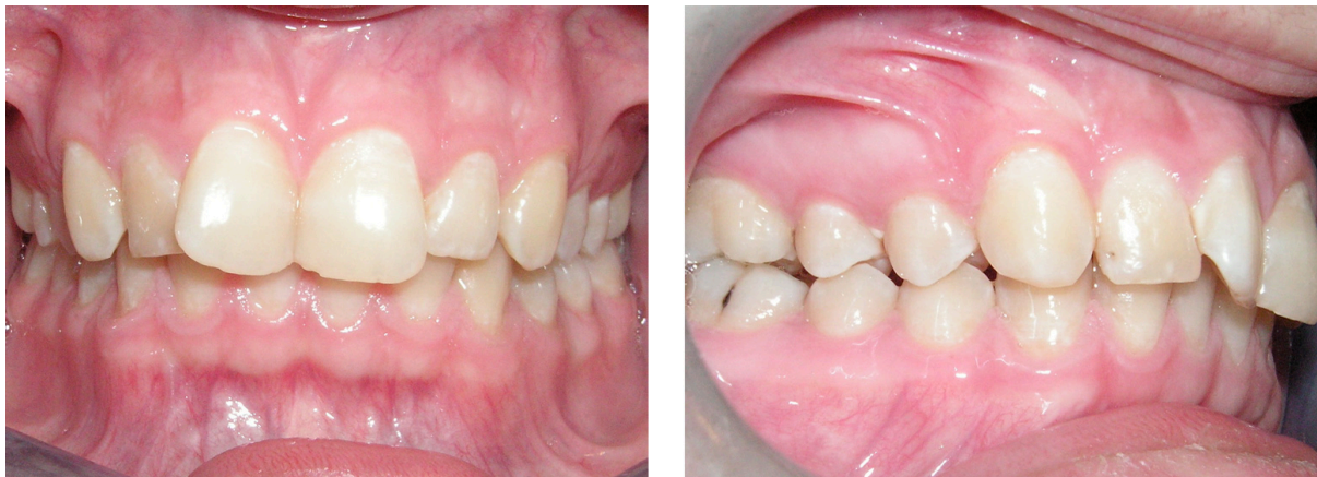
Figure 1. Intraoral photos taken at the start of the treatment.

The same examiner assessed the magnitude of the method error by retracing and measuring the 20 randomly selected cephalograms after an in-