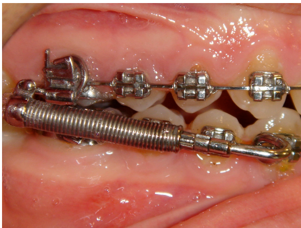
Figure 2. The application of Forsus™ FRD in the mouth.

Likewise maxilla, no significant sagittal and vertical changes were found in the mandible (Table 6). In the control group although limited differences due to growth were observed at SN/MP angle and Ar-Pg length, these were found statistically not significant when two groups were compared and no self-correction of Class II was obtained due to these changes.