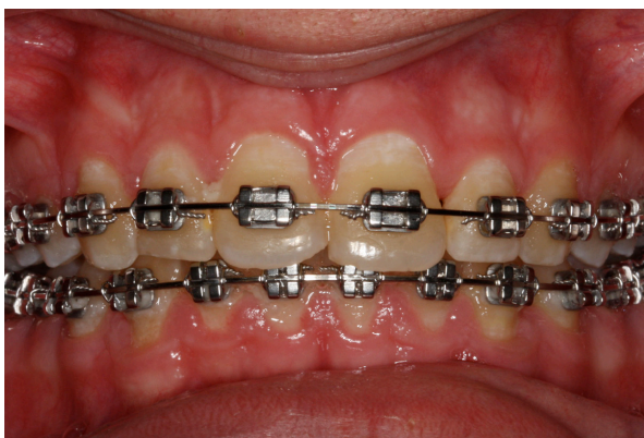
Figure 3. Intraoral photos taken right after the removal of Forsus™ FRD.