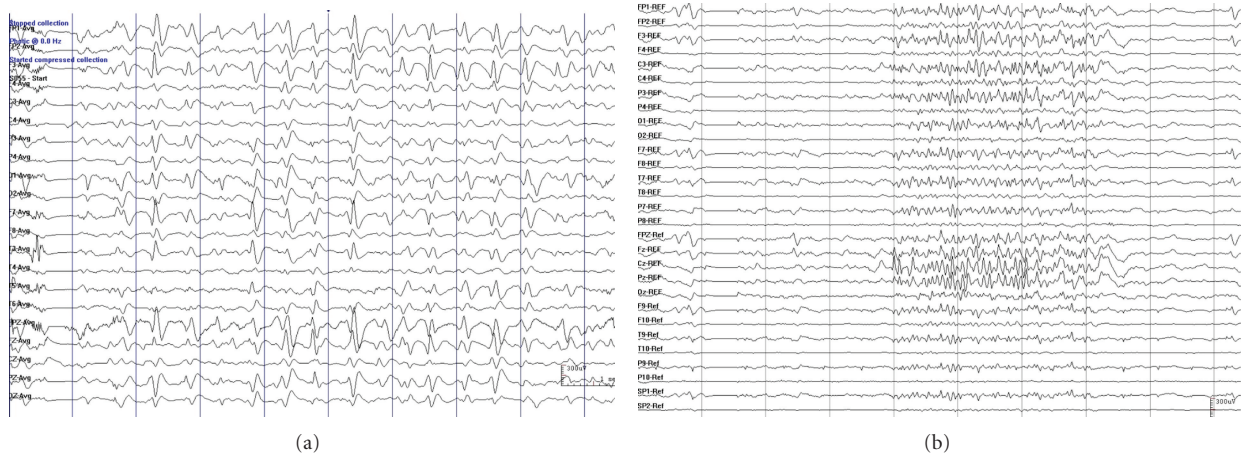
FIGURE 1: Representative EEGs showing slow spike-and-wave hemispheric dominance and PFA hemispheric dominance characterized by that the amplitude of epileptiform discharges in one hemisphere is higher than that of the other hemisphere (Figures 1(a) and 1(b)) and that the onset of the epileptiform discharges in one hemisphere is earlier than that of the other (Figures 1(a) and 1(b)), as well as that the duration of the epileptiform discharges in one hemisphere is shorter than that of the other (Figure 1(a)). Data were from patient no. 2 in Tables 1 and 2.