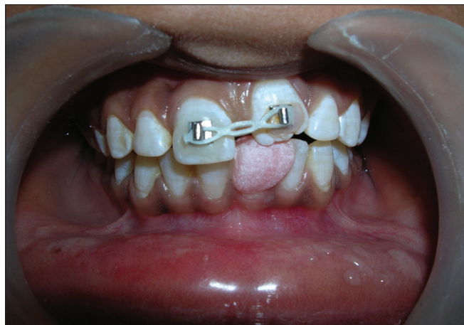
Figure 6: Bonded bracket on 11 and 21 with elastic chain and cemented inclined plane on 31