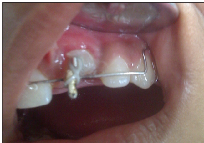
Figure 4: Removable appliance with elastic traction