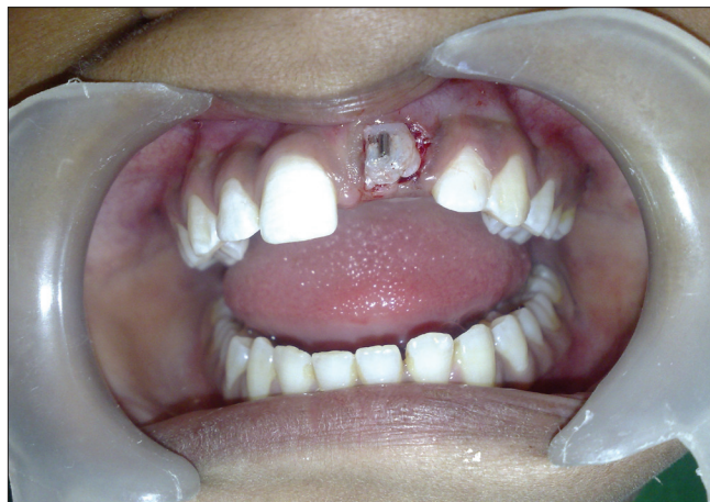
Figure 3: Surgical exposure of 21 with bonded bracket on labial aspect