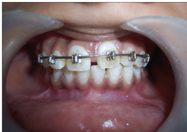
Figure 7: Fixed orthodontic correction