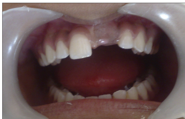
Figure 1: Missing permanent maxillary left central incisor

A combined surgical-orthodontic approach was used to align the dilacerated incisor. Surgical exposure of the crown of the impacted incisor provided access for coronal bracket attachment [Figure 3]. The orthodontic treatment