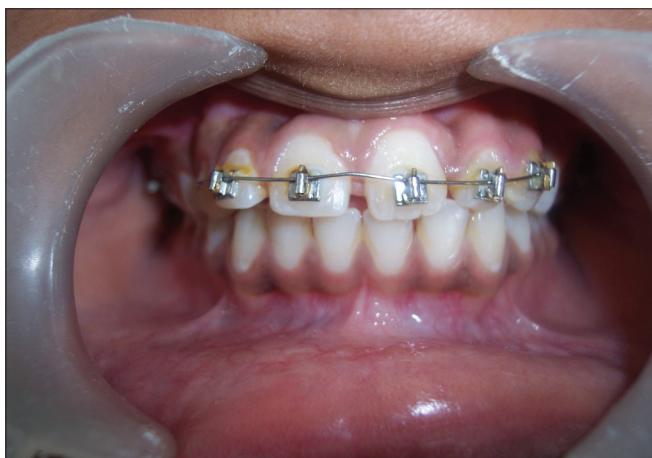
Figure 8: Photograph showing 21 in desired position at the end of the treatment

no complication related to the traction and alignment of the tooth. The treatment in this phase completed in 2 months. The results after completion of the treatment were satisfying, with the tooth in correct esthetic and functional position with normal gingival contour and healthy periodontium [Figure 8].