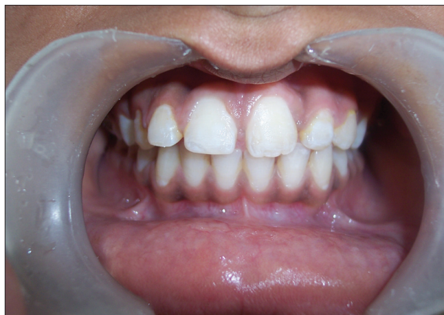
Figure 9: After 2-year follow-up

It is suggested that the success rate of dilacerated impacted