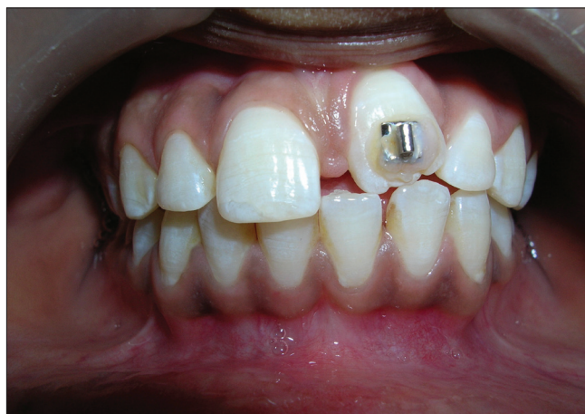
Figure 5: Developing cross-bite of 21