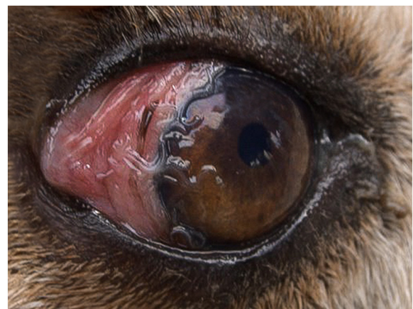
Figure 1 Conjunctivitis in a dog with Thelazia callipaeda . Adult specimens of Thelazia callipaeda provoking conjunctivitis and mucopurulent discharge in the eye of a dog from Italy (Basilicata).

Dogs and cats were physically examined by the veterinarian at enrolment (D0) and then at two follow-up visits, (D7 and D14). A general physical examination was