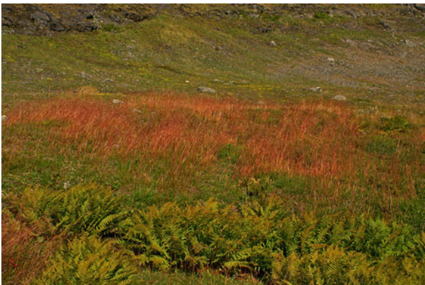
Fig. 4 Prior snowbed community recently overgrown by a dense grass cover, predominantly Deschampsia flexuosa

Moss-rich dwarf-shrub heaths, grass heaths and meadows had increased their coverage at the expense of snowbed communities, mires and open water. The ultimate reason was inferred to be climate warming, associated which earlier and more effective snow melt, depletion of cold melt water and a consequent general drying out of alpine soils (Fig. 3). Repetitions of these line-intercept studies and resurveys of permanent plots have evidenced that these trends have intensified during the past two decades (Kullman 2004a, 2007a, b).