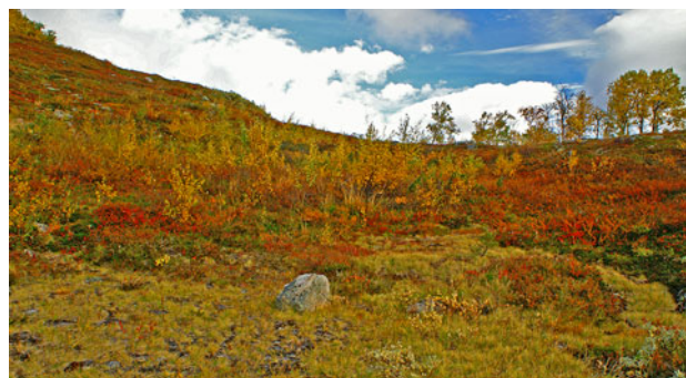
Fig. 1 Rapidly growing young birches invading a slope concavity where previous late-lying snow cover prohibited any growth of birch

Seed production and viability of most tree species have increased substantially over the past few decades and even prostrate krummholz individuals of spruce and pine growing above the treeline have broken their long-term reproductive ‘silence’ (Kullman 2007b). Treelines of mountain birch ( Betula pubescens ssp. czerepanovii ), Norway spruce ( Picea abies ) and Scots pine ( Pinus sylvestris ) have risen altitudinally by a common maximum of slightly more than 200 m since the early twentieth century, thereby reaching their highest positions for the past 7,000 years (Kullman and Öberg 2009). Between 1975 and 2007, the rate amounts to 0.65, 1.34 and 1.66 m/year, for birch, spruce and pine, respectively (Kullman and Öberg 2009). However, most investigated sites display upshifts of smaller magnitudes and rates, since local topoclimatic constraints commonly prevent treelines from obtaining their potential thermal limits. The upper limit of closed forest has changed much less than the treeline (Kullman 2007b; Kullman and Öberg 2009). Therefore, it seems unlikely that projected future climate warming (IPCC 2007) would substantially threaten the continued existence of an extensive treeless alpine zone in the Swedish Scandes, as simplistically speculated (Moen et al. 2004). However, the alpine landscape is marginally shrinking and