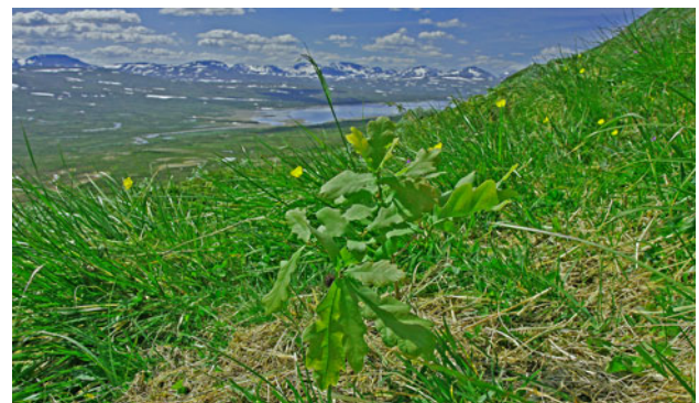
Fig. 8 A genuinely thermophilous tree species, Quercus robur , has established at a very high elevation, close to the treeline of mountain birch. Two specimens were found in 2005 and by 2008, one was still alive and vigorously growing (this photo)

A particularly strong indication of rapid responses to climatically more favourable growing conditions in high mountains is provided by recent establishment of thermophilous tree species, Quercus robur (Fig. 8), Ulmus glabra , Acer platanoides , Alnus glutinosa and Betula pendula , close to the birch treeline in the southern Swedish Scandes. Macrofossils indicate that these species have not grown here since the thermal optimum 8,000–9,000 years ago (Kullman 2008). Some particularly warmth-demanding herb species, Anemone nemorosa , Chrysosplenium alternifolium , Polygala amarella and Pteridium aquilinum , have recently spread upslope to approximately the same relative elevations as the last-mentioned tree species. At least in the case of Pteridium , warmer winters are likely to