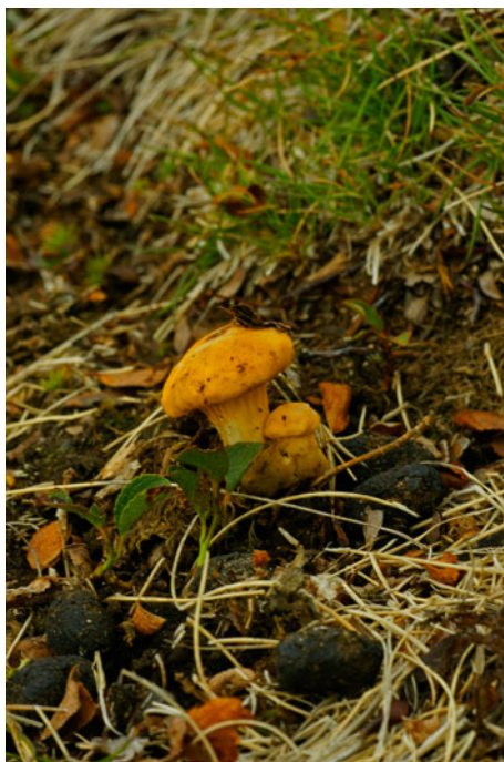
Fig. 7 For the first time, Cantharellus cibarius has been recorded in the mid-alpine zone and in close association with newly invaded potential vascular plant mycorrhiza hosts of silvine affinities

The floristic inventories from the early 1950s (Kilander 1955) contain a wealth of precise information concerning the prior local altitudinal limits (m a.s.l.) of the vascular plant species, which have invaded the mountain summits. Comparisons with their present-day positions show that these limits have risen by a mean of about 200 m, although with a significant species-specific and site-specific spread (20–780 m) (Kullman 2004a, 2007a, b). This implies an average upslope migration rate of 35–45 m per decade, which exceeds rates obtained from analogous studies in the European Alps (Walther et al. 2005), although it matches