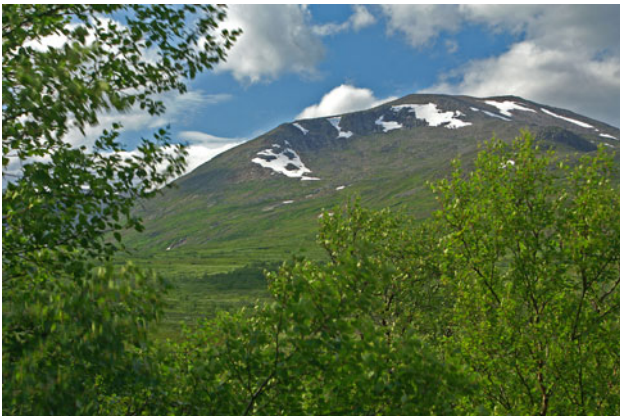
Fig. 3 Late-lying snow fields constitute a vital part of the alpine ecology. Their earlier disappearance during recent summers contributes to a profound transformation of alpine, subalpine and upper boreal vegetation