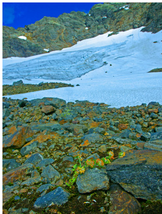
Fig. 10 The herb Anthyllis vulneraria , has recently become established on a glacier moraine, 1,355 m a.s.l., which is about 700 m higher than previously recorded in this region

aspect is little studied, mostly since historical distribution data are extremely scarce in that respect. However, at one site in the southern Swedish Scandes it was found that Ranunculus glacialis had declined in abundance close to its lower margin, which had also retracted uphill by 135 m between 1980 and 2003 (Kullman 2007a). Whether that is just some local stochastic process or due to enhanced competition, alternatively more direct effects of the climate, cannot be judged without more detailed and extensive data. Support for the first-mentioned alternative is provided by data from a nearby locality, showing that Ranunculus glacialis still grows at lower elevations (Öberg 2009). Notably, some high-alpine plants (e.g. Ranunculus glacialis , Dryas octopetala and Silene acaulis ) are actually extending their ranges downhill along roadsides in different parts of northern Scandinavia (Kullman 2006; Westerström 2008; Birks et al. 2008; http://www.kullmantreeline.com ).