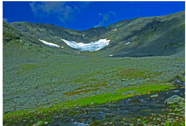
Fig. 5 Frontal recession of glaciers is exposing extensive unvegetated forefields at high elevations, appropriate for evolution of snowbed communities and serving as refuges for alpine plant species

Most conspicuous is the contraction and transformation of snowbed communities to proliferous alpine grasslands ( Deschampsia cespitosa , D. flexuosa , Poa alpina ) (Fig. 4). Earlier dominants in these habitats, i.e. hygrophilous alpine herbs, mosses and liverworts, are facing suboptimal growing conditions and increased competition for light and other vital resources (Kullman 2004a, 2007a, b). The validity, in principle, of this successional pathway in a warmer climate is supported by paleoecological data from