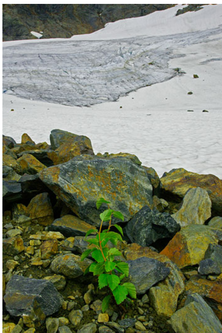
Fig. 11 Saplings of birch have colonized ice-cored moraines close to glacier margins, about 500 m above the treeline

ingredients in the new mountain landscape. Like the situation in the warm early Holocene (Kullman and Kjällgren 2006), the relatively cool and humid high mountains, with their more stable snow cover, may again become an important resort for the spruce.