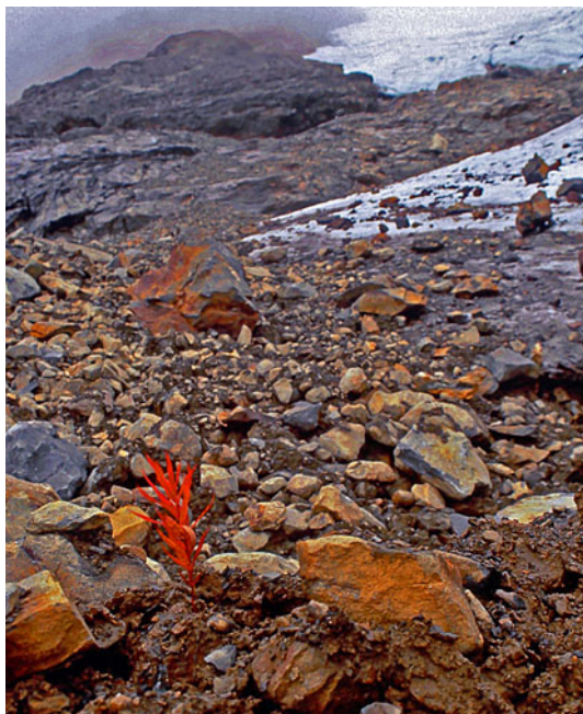
Fig. 9 A young individual of Epilobium angustifolium growing on the margin of a debris-covered glacier

Theoretically, climate warming would also raise the lower limits of true alpine plants (Peters et al. 1992). This