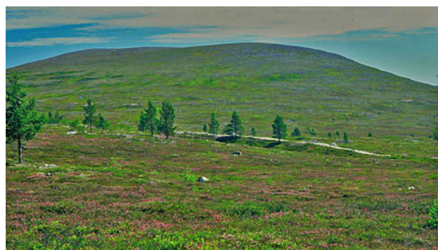
Fig. 2 In the southernmost Scandes, a belt of pines is currently forming the new arboreal border towards the alpine tundra

becoming increasingly fragmented by protruding birch forest wedges and tree islands (Kullman 1979, 2007b, 2010; Kullman and Öberg 2009). In particular, concave slopes and minor swales with a favourable microclimate and ample snow cover are colonized with sparsely scattered and rapidly growing mountain birches (Fig. 1).