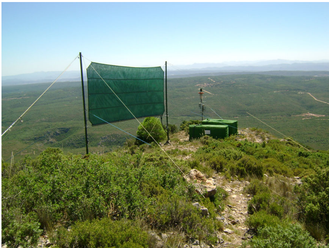
Fig. 1 Image of the 18 \text{ m}^2 flat-panel fog collector located at Mount Machos (Valencia region, Spain), together with the water tanks

The Raschel shade net material from a Chilean manufacturer is used in most fog collector applications worldwide. The material (Fig. 2) is made of food-safe polyethylene and has a fiber width that is effective at