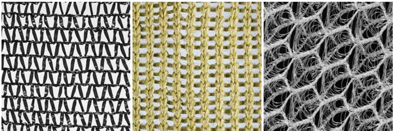
Fig. 2 Three mesh types for fog collection. The Raschel mesh (35% shading, left panel , www.marienberg.cl ) has been successfully applied for many years in 35 countries in five continents. It is used double layered in SFC and LFC (only one layer is shown here). The middle panel shows a robust material with a stainless mesh, co-knitted with poly material ( http://www.meshconcepts.co.za ), which has been

employed in South Africa. The right panel shows a newly proposed design of a three-dimensional net structure (1-cm thickness) of poly material ( http://www.itv-denkendorf.de ). Note that no overall comparison of mesh collection rates and technical performance has been conducted yet. The edge lengths of mesh sections shown are 6.5 cm