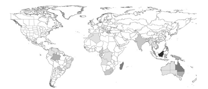
Fig. 2. Map of observed richness of genera endemic to three or fewer political regions. Darker colors indicate the presence of more endemic genera. Endemic diversity ranges from zero (white) to eight (black) genera per region.

To date, when conservation targets have been chosen at the global scale, the assumption has been that regions that are diverse for birds, mammals, or plants will also be diverse for the rest of life. However, in many cases the diversity patterns of plant or vertebrate taxa do not correlate spatially (34–41), which is to say they are not congruent. An alternate approach to comparing patterns in the large-scale distribution of taxa is to consider the