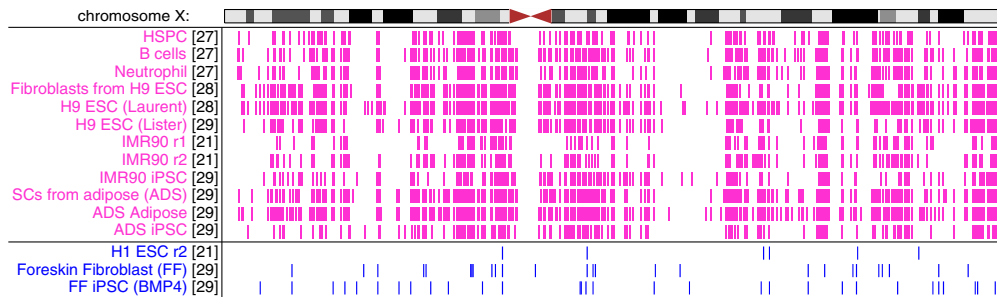
Fig. 2. Locations of AMRs identified on chrX. All female data (pink) was included. Only male methylomes (blue) with sufficient coverage on chrX are shown because these have coverage reduced by 50% compared with autosomes. Numbers in brackets indicate references for data sources. See text and Dataset S1 for information about methylomes.

methylation levels through these intervals ( Fig. S2 ). The iPSCs correlated better with ESCs than with the somatic cells from which they are derived, suggesting that ASM has in general been successfully reprogrammed in these iPSCs.