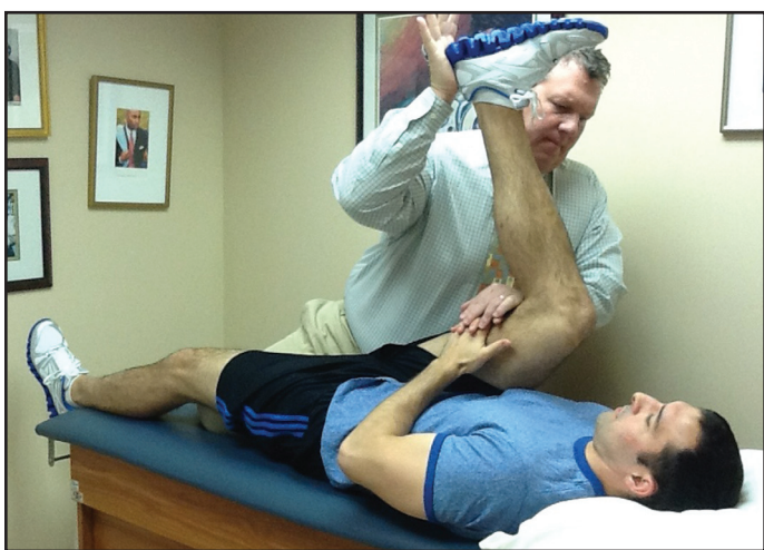
Figure 7. Lengthened state manual muscle hamstring test.

Hamstring injuries have long been the bane of athletes' participation in sport among those who engage in sprinting and explosive movements, primarily because of both the high occurrence and recurrence rates. These injuries appear to create subsequent weakness at the muscle's lengthened state, predisposing the athlete to further injury. Lengthened state eccentric training may increase the end range