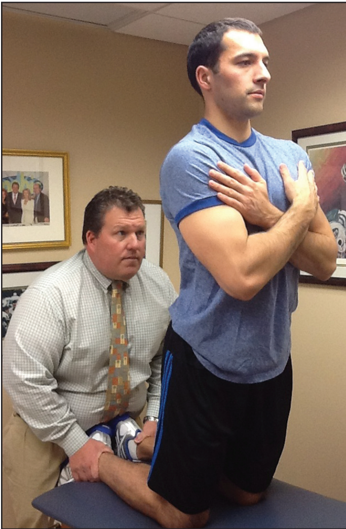
Figure 3. Nordic hamstring exercise.