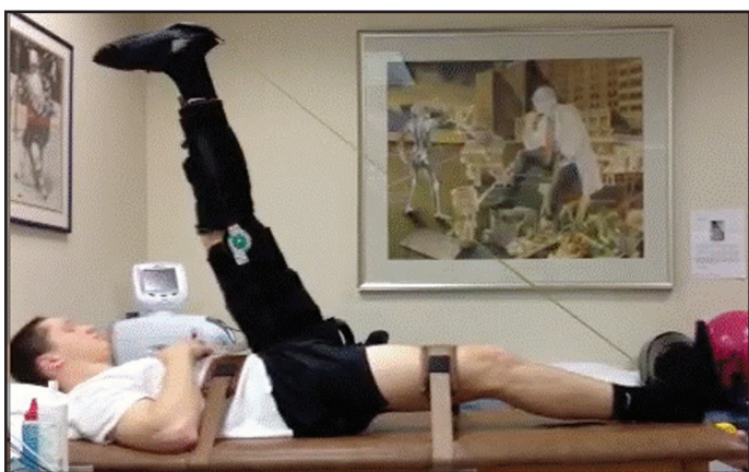
Figure 6. Dynamic hamstring flexibility test (H-test).

remains flat on the table. The clinician then passively extends the knee until met with soft tissue resistance (i.e. putting a stretch on the hamstring). The clinician backs off by allowing the knee to flex 10 degrees from maximal stretch (Figure 7). From this position the clinician conducts the break test of the hamstring, and grades it using the tradition 0-5 scale established by Kendall or objectively by using a handheld dynamometer.