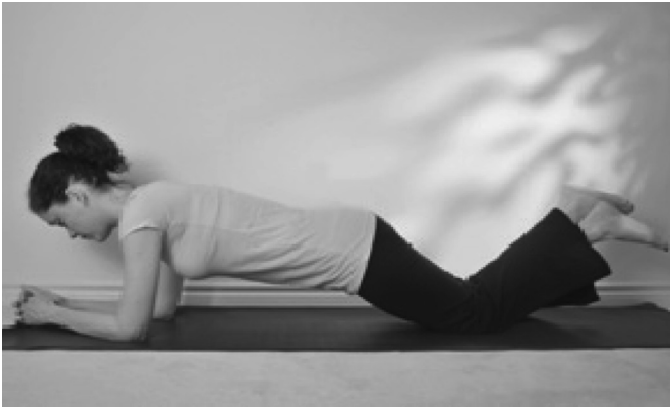
Figure 4A Beginner prone plank (on knees)