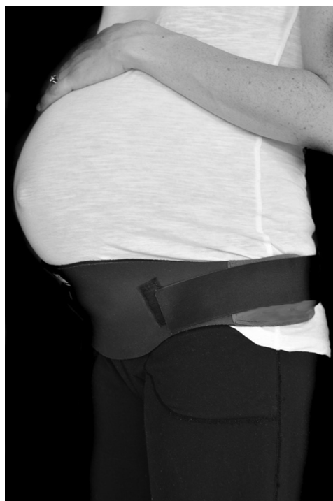
Figure 3 Pregnancy pelvic support belt (Trainer's Choice ® )

her pain with walking. On her fourth, fifth and sixth visits she reported that the baby was "lower" in her abdomen and that her pain had plateaued to a "manageable" state.