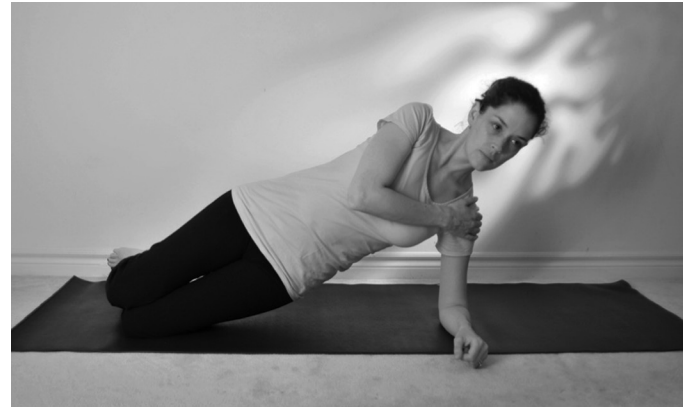
Figure 5A Beginner side bridge (on knees)