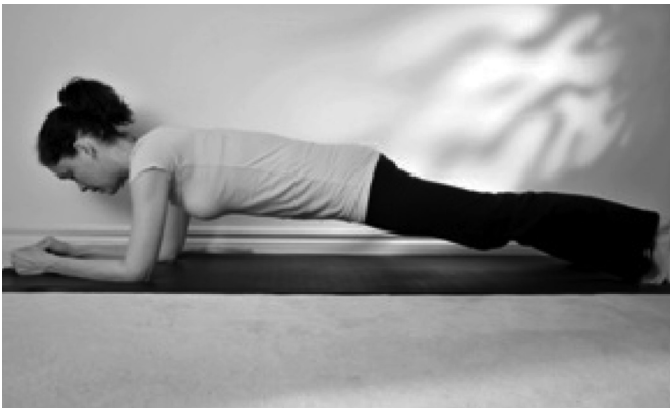
Figure 4B Advanced prone plank (straight legs)