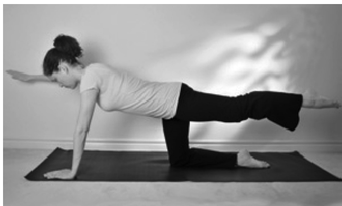
Figure 6 Bird dog

instructed to be performed daily with 8–10 second holds and progress to more repetitions as tolerated. 20