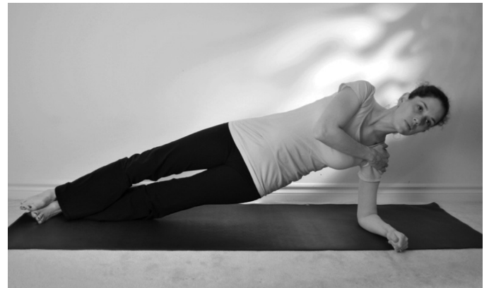
Figure 5B Advanced side bridge (straight legs)

spinae, quadratus lumborum and gluteal muscles. The working diagnosis was acute right sacroiliac joint dysfunction and myofascial strain. Treatment included interferential current (IFC), soft tissue trigger point therapy and lateral recumbent sacroiliac and lumbar spine Diversified adjustments. 13,14 Home recommendations included: icing, Epson salts baths, continuing pelvic floor exercises (Kegels), as well as adding deep abdominal bracing and gluteus maximus activation during her daily activities to re-establish her core strength and endurance. On her next visit four days later she reported the pain was much better, having greatly decreased in intensity had an increase in her mobility. She reported that taking over-the-counter Tylenol® helped as well. After a similar treatment, home recommendations included the same as the previous visit with the addition of short distance walking (within her