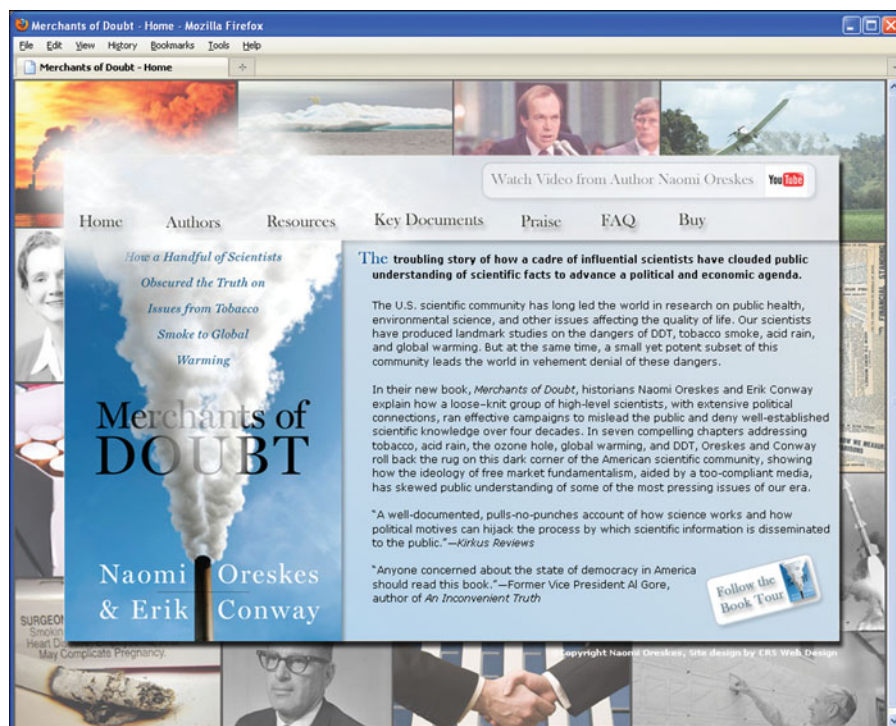
Figure 3. The book Merchants of Doubt is a masterly work of science, history, and investigative reporting on the role of some scientists in denying global warming and other issues. The companion website has excellent primary and secondary resources relating to the authors' voluminous research.

could conduct their own independent scholarship and draw their own conclusions as part of course assignments.