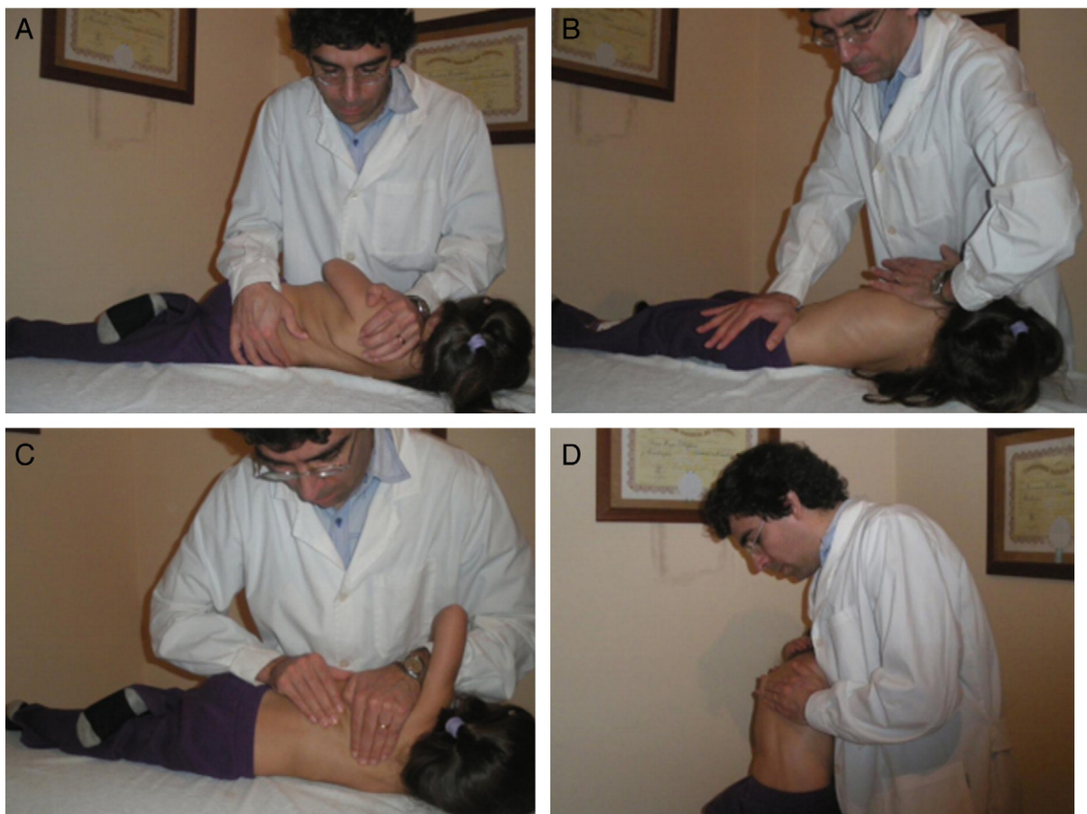
Fig 1. Derotation technique. A, Lumbar derotation technique, in the lateral decubitus, in the lumbar scoliosis convex to left. B, Technical standardization in dorsal recumbency in the lumbar spine in rotation with restricted mobility. C, Thoracic derotation technique, in the lateral decubitus, in the thoracic scoliosis convex to right. D, Thoracic derotation technique, in the sitting position of a thoracic scoliosis, convex to the right.