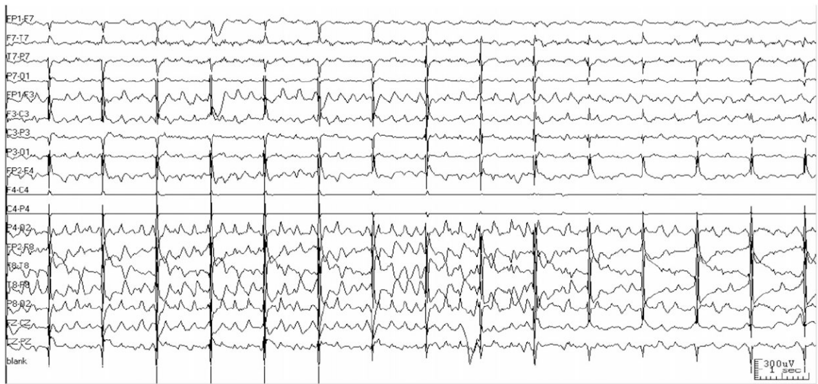
Fig. 1. Minimal rTMS artifact on EEG. This 15-second tracing shows a seizure terminating during rTMS. The C4 lead has been removed for rTMS coil placement. Note that the 1-Hz rTMS artifact (vertical lines) does not obscure the EEG, and enables accurate assessment of seizure duration.