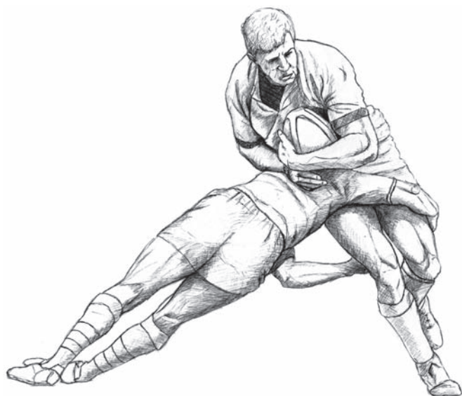
Figure 3 The Tackler mechanism. The abducted arm of the tackling player is forcibly extended behind the player, exerting leverage on the glenohumeral joint.