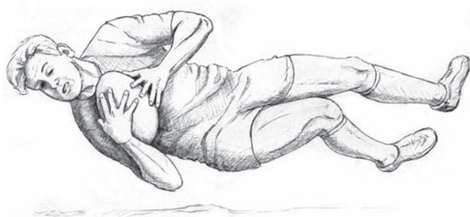
Figure 4 The Direct Hit mechanism. Medially directed compressive force to the adducted arm by contact with another player or the ground results in injury.