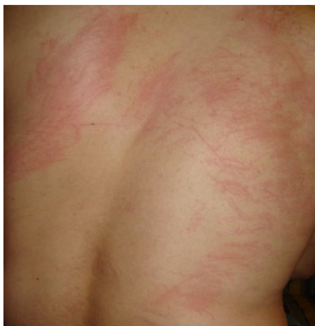
Figure 1. Non-pruritic urticarial skin lesions negative.

The bacteriological cultures of urine, blood, and sputum and tuberculosis culture of the sputum were