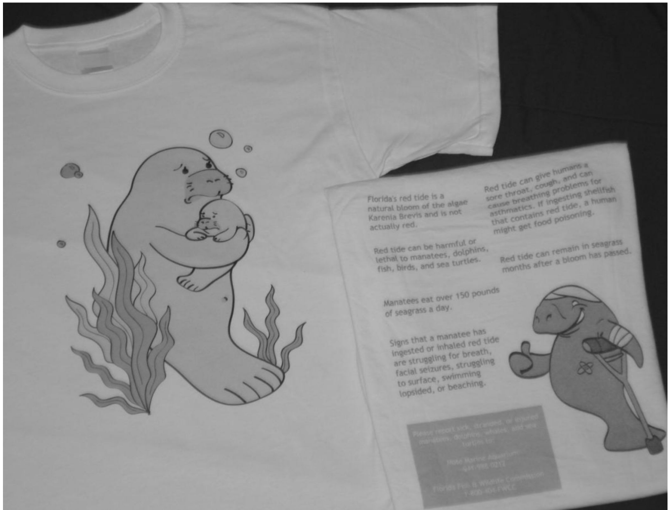
Figure 5. An example of one of the top-ranking projects, a t-shirt about the effects of Florida red tide on manatees.