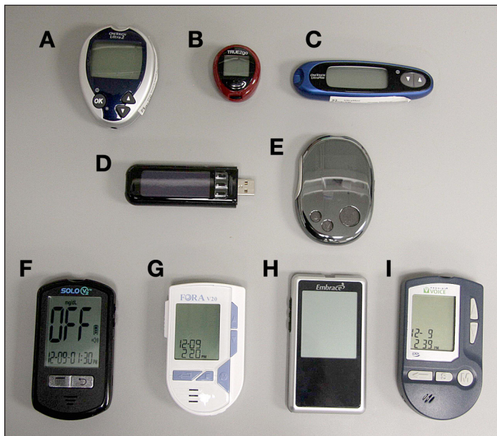
Figure 1. The BGMs included in this study: (A) OneTouch Ultra2, (B) TRUE2go, (C) OneTouch UltraMini, (D) Contour USB, (E) Fora G90, (F) Solo V2, (G) Fora V20, (H) Embrace No Code, and (I) Prodigy Voice.

To measure the display characteristics of SVDs, an optical instrumentation system (shown and described in Figure 3 ) was used to capture and process images of the displays. Contrast and reflection measurements were obtained