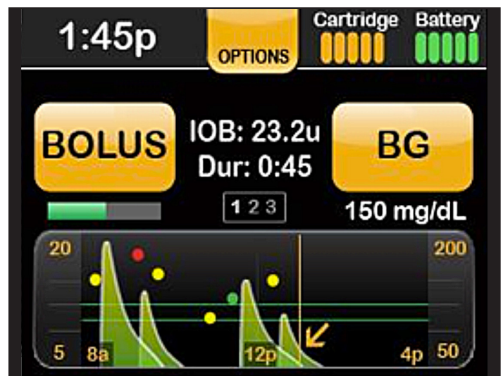
Figure 2. Design iteration of the home screen.

During several of the early usability tests, it was revealed that participants struggled with data entry, navigation, and information retrieval tasks. One example of design improvements to the home screen that occurred as a result of this iterative usability testing is exemplified in Figure 2 .