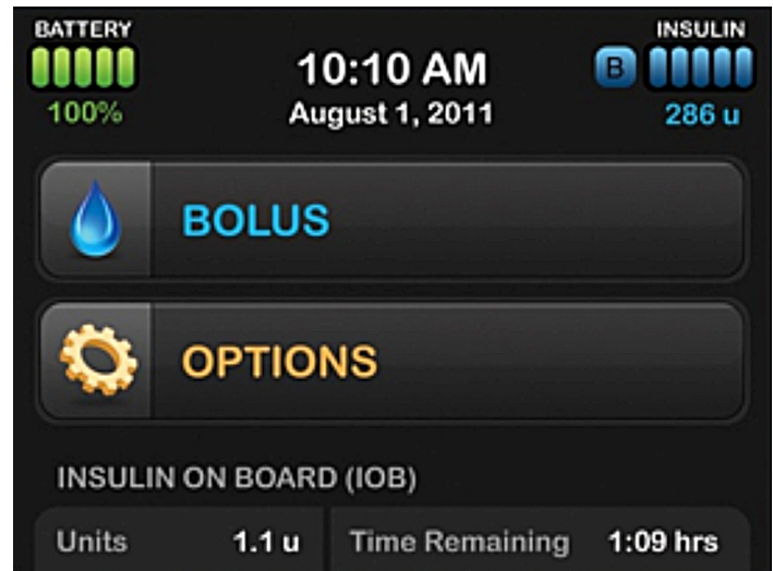
Figure 3. Validated home screen design.

The improvement in the usability of the interface was further substantiated through a system usability scale (SUS) questionnaire that participants completed after their sessions. The SUS yields a single number which represents the overall usability of the system. 9 Figure 4 shows higher SUS scores for the new interface versus the old.