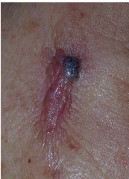
Fig. 3. Morpheic, morpheaform or cicatricial basal cell carcinoma.