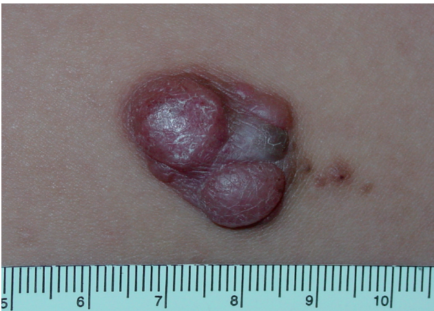
Fig. 2. Cystic basal cell carcinoma.