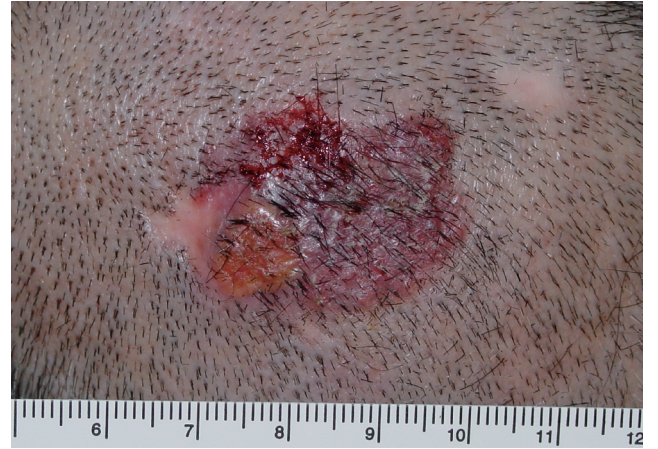
Fig. 4. Infiltrative basal cell carcinoma.