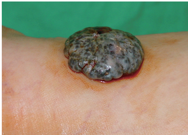
Fig. 9. Polypoid basal cell carcinoma.