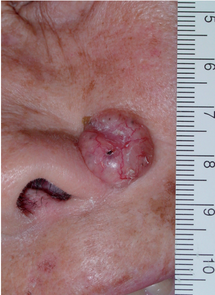
Fig. 1. Nodular basal cell carcinoma (classic BCC).