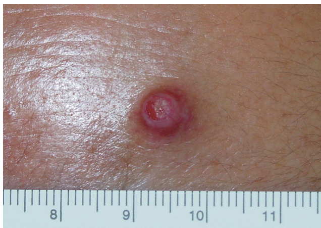
Fig. 8. Fibroepithelioma of Pinkus.

- Fibroepithelioma of Pinkus (Fig. 8): most commonly occurs on the lower back, groin, or thigh areas; may grow to