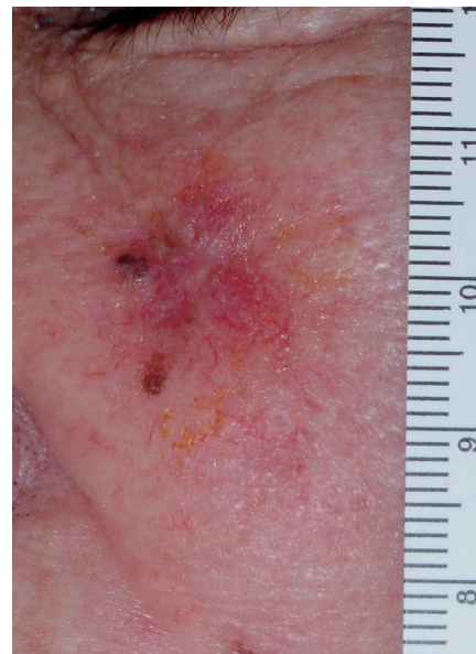
Fig. 5. Superficial basal cell carcinoma (superficial multicentric basal cell carcinoma).