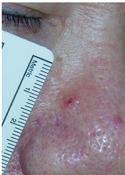
Fig. 10. Pore-like basal cell carcinoma.