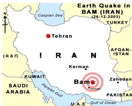
Fig. 1. Dehbakri Country, located in Bam District, Kerman Province, south of Iran

Dehbakri County is located at the foothill of Jebal-Barez Mountain and 48 km far from southwestern of Bam District (Fig. 1). The population of Dehbakri County was 2470 in 2009. The topography of these localities is foothill with the mean altitude of 2000 m above sea level. This area has a semi-desert climate, temperate at summer and cold at winter. The mean of monthly maximum and minimum temperatures were 40 °C and -5 °C in July and Dec respectively. The total annual rainfall was 220 mm. The minimum and maximum of monthly relative humidity were 45% and 92% respectively in July and Jan.