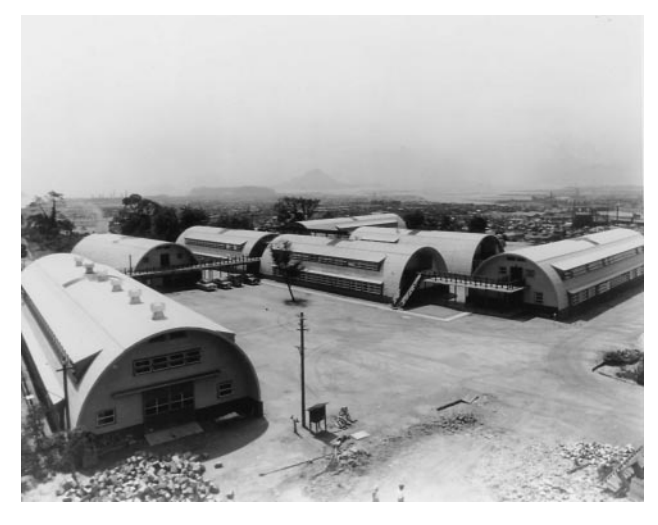
FIG. 3. Quonset huts on Hijiyama Hill constructed in 1950 comprised the first permanent laboratory of ABCC. In 1997, they still remained in use as part of an enlarged laboratory