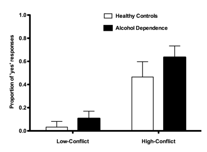
Figure 2. Moral judgments of the personal moral dilemmas, further subdivided into low- and high-conflict respectively. The proportion of 'yes' responses are shown for the two groups. Alcohol dependent patients were more likely than healthy controls to respond 'yes', i.e. endorsing the proposed utilitarian action, when faced with the high-conflict dilemmas (P = 0.036), while the difference was less pronounced for the low-conflict dilemmas (P = 0.063). Error bars indicate 95% confidence intervals. doi:10.1371/journal.pone.0039882.q002

The results of this case-control study of AD patients and healthy controls confirmed the hypothesis that AD patients generate increased utilitarian moral judgments when faced with moral personal dilemmas, compared to healthy controls. The subjects responded to a battery of dilemmas divided into non-moral, moral impersonal and moral personal dilemmas (further subdivided into low- and high-conflict), and 15 items evaluating knowledge of explicit social and moral norms. Since AD patients exhibit