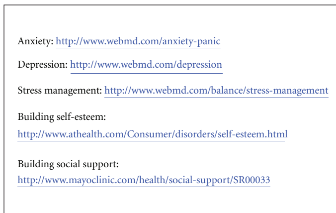
FIGURE 3: Internet resources for nurse educators and nursing students.

spending more time talking with trusted individuals and not isolating oneself. Previous studies have also recommended a variety of ways to improve self-esteem and social support for nursing students [39, 66]. For additional recommendations, see Figure 3 for internet resources on building self-esteem and social support.